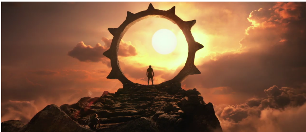
Fig. 2: The stone circle through which Horus travels to the solar barque of Ra ( Gods of Egypt , USA/AU 2016, 40m 16s)