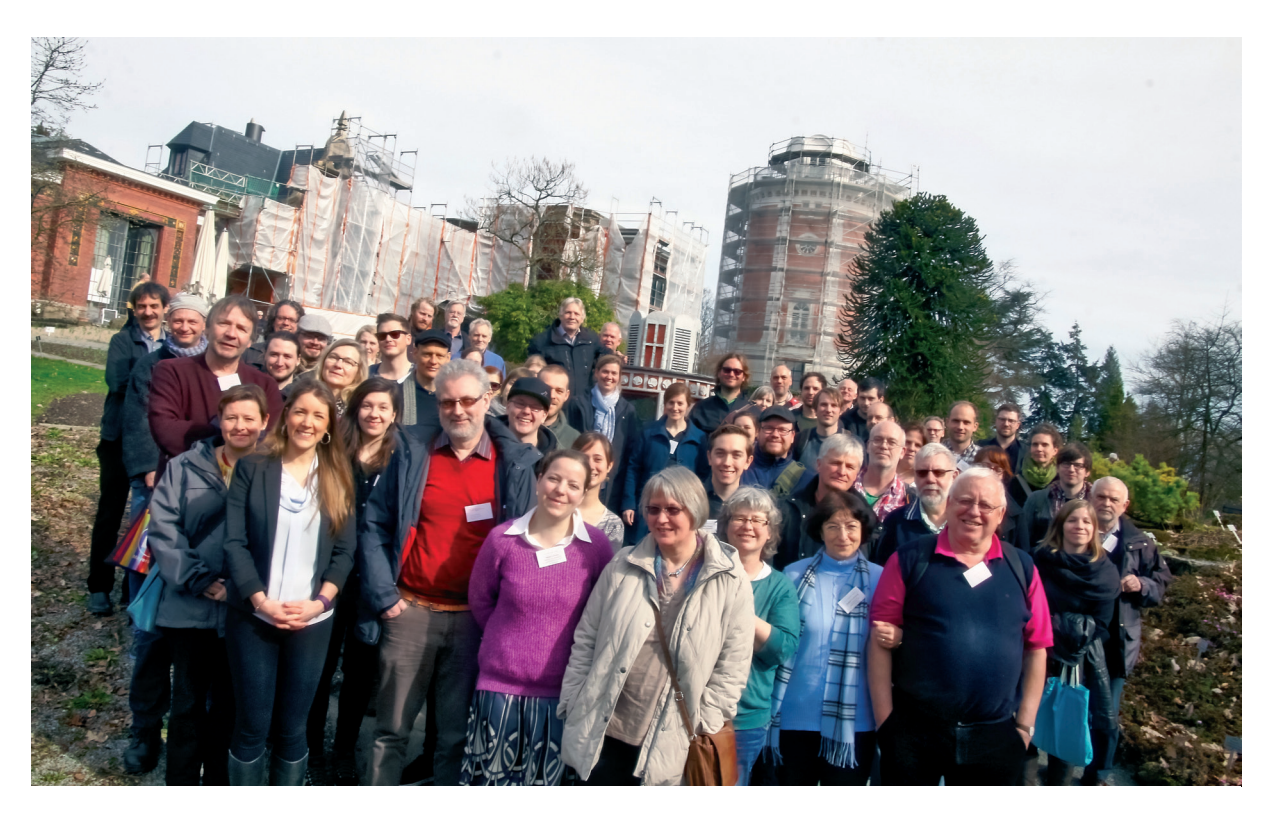
Fig. 7 Another Group photograph of the attendees in front of the venue.

(2009). Genetic Discontinuity Between Local Hunter-Gatherers and Central Europe's First Farmers, Science 326, 137–140.