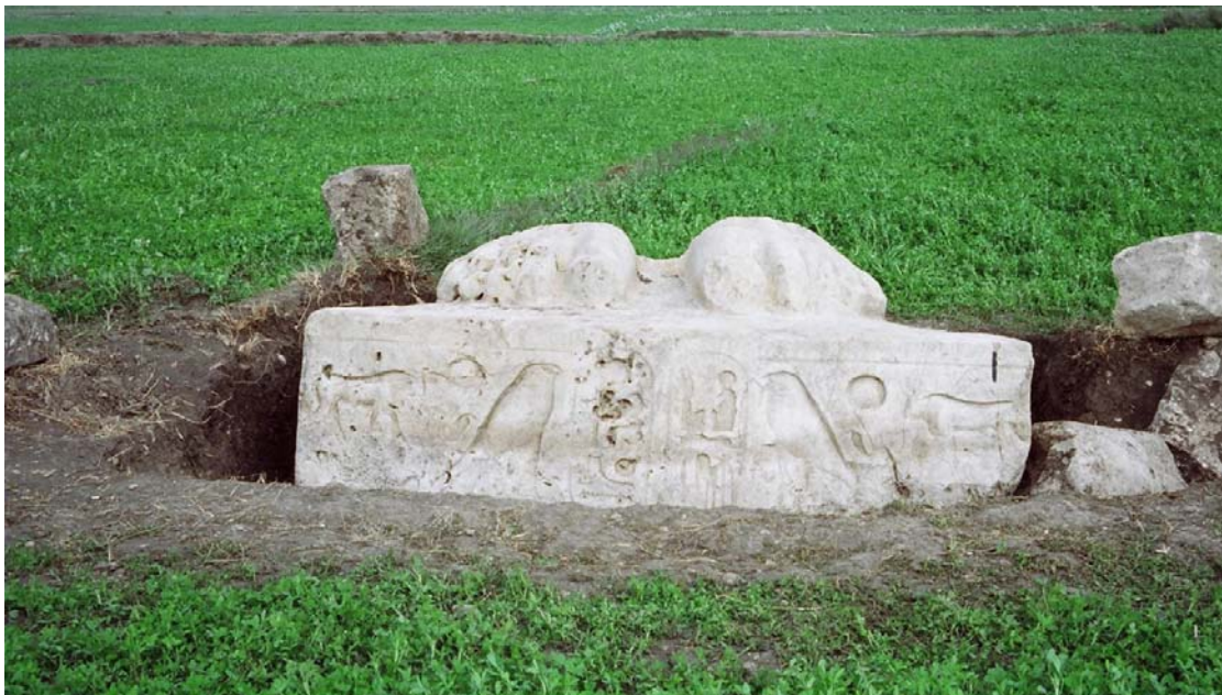
Fig. 2: The base and feet of a seated statue of Ramesses II during an excavation in its vicinity in 2001.

On the surface, only the base and the feet of a colossal seated statue of Ramesses II (Fig. 2), a fragment of the lap of the same or another statue as well as two column bases bear