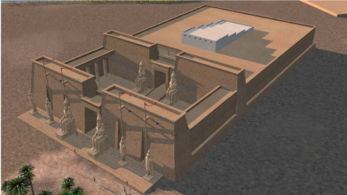
Fig. 8: Reconstruction of the North Temple of Pi-Ramesse. This reconstruction is based on the magnetic survey and parallels in Medinet Habu and Thebes. (Credit: © artefacts-berlin.de).