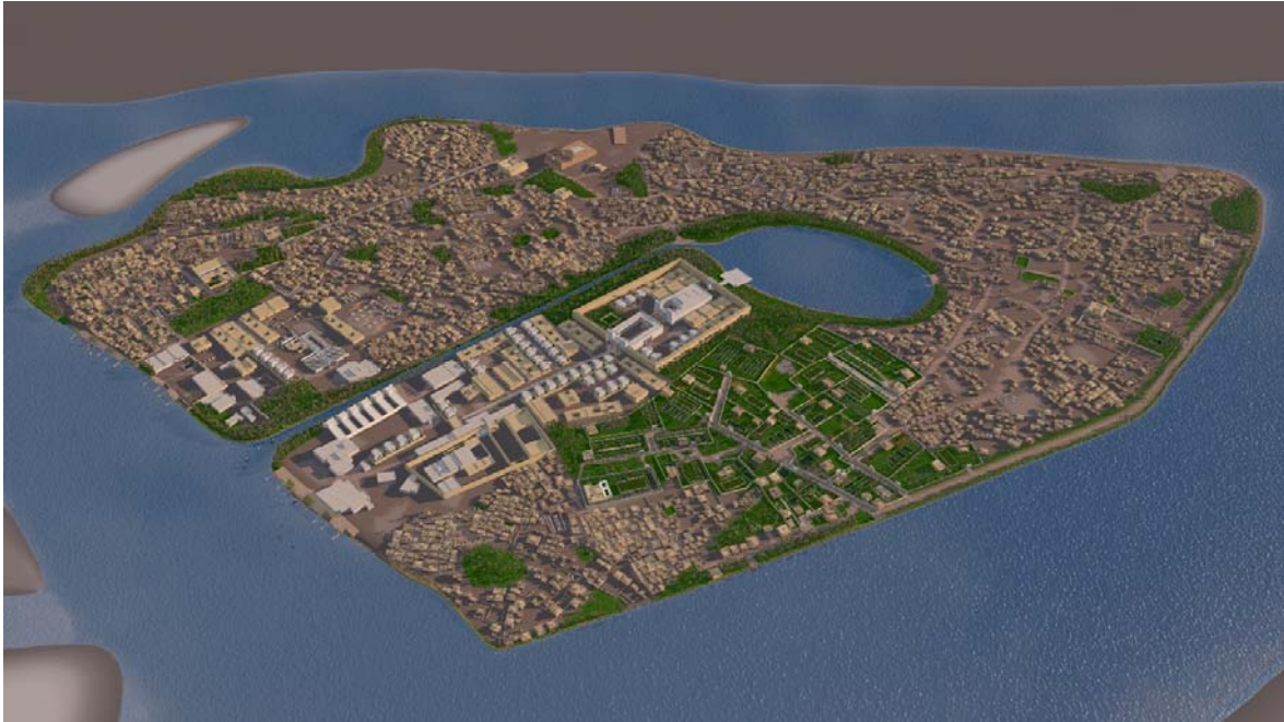
Fig. 6: Overview of the reconstruction of Pi-Ramesse. The image shows the complete reconstruction. (Credit: © artefacts-berlin.de)

Virtual reconstructions range from very basic approaches to artistic masterpieces. Recent advances in technology also enabled the growing hyperrealism of such models, 21 as the use of modern 3D software becomes widely accessible and popular. Therefore, the number of decent looking reconstructions is increasing. As beautiful as these are, an obvious disadvantage is the subjectivity involved. To be more precise, it is the unknown amount of subjectivity that was involved in creating them. We simply do not know how much we can rely on them. 22 Additionally, elaborate reconstructions also convey the notion of authority, which suggests a non-existent validity, while scientifically based reconstructions should only be a mere suggestion or proposal. 23 Placed in a museum or on television, these reconstructions often get accepted by the audience without any hesitation. 24