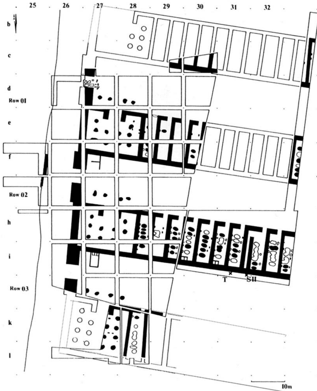
Fig. 4: Plan of the stables in Q IV. Stratum Bb (Drawing Anja Herold).

Site Q IV, examined between 1988 and 1998, yielded large stables for at least 480 horses (Figs. 3-5). They can be interpreted as a royal stud farm and represent once more a building which had never been excavated from that period. The discovery of the stables also confirmed the statements known from the texts of Papyrus Anastasi III, 7,5-6, which refer to the “stables for thy (the king’s) chariotry”.