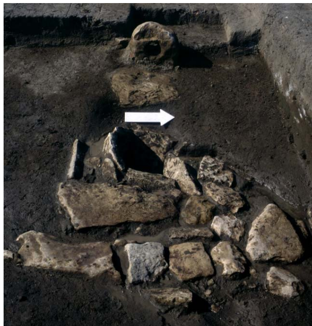
Fig. 3: The stables in Q IV during excavation. Visible is a box for one horse including the stone pavement, a tethering stone and a small stone-lined pit to collect the urine which most likely was subsequently used for processing leather.

Since 1980, the Roemer- und Pelizaeus-Museum Hildesheim has carried out excavations at eight areas at the site. The most important discoveries of site Q I, excavated between 1980 and 1987, were the bronze production facilities with a capacity unknown from any other site excavated to this date from the Late Bronze Age. Connected were workshops for bronze weapons.