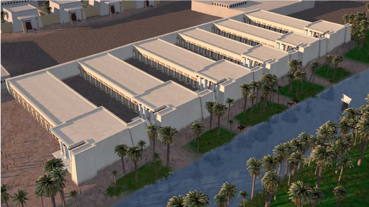
Fig. 5: Reconstruction of the stables. Visible are the six rows of which four were excavated. The proximity to the canal suggests, that it might have been used to bathe the horses..

In later years, three smaller excavations were opened to check the results of the magnetic measurements conducted since 1996. These works resulted in finding two buildings, most probably official, though their exact function was not revealed. The most important find of that work was the discovery of a fragment of a cuneiform tablet in 2003 at site Q VII. 10 In 2016, new excavations were started in site Q VIII in order to unearth information on the largest building complex visible in the magnetic measurements. 11