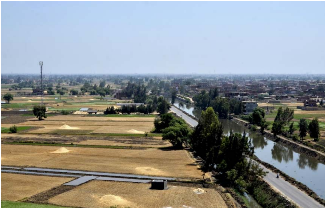
Fig. 1: View from the water tower over modern Qantir showing the absence of visible tulul.

resulting from settlement activities), which were still visible at the end of the 19th century, were levelled during the 20th century 5 (Fig. 1).