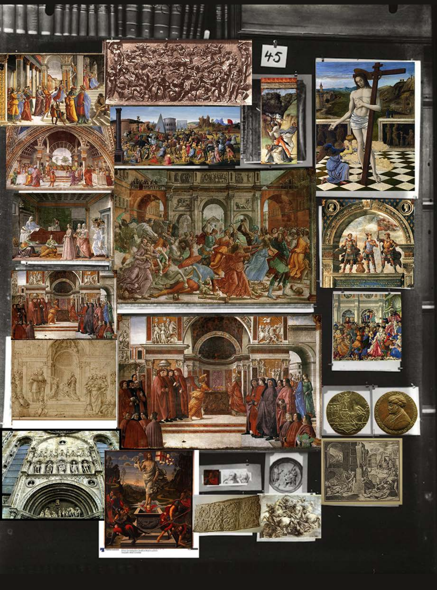
Figure 1. Aby Warburg's Panel 45 with the color version of the images mapped over the black-and-white photographic reproductions.