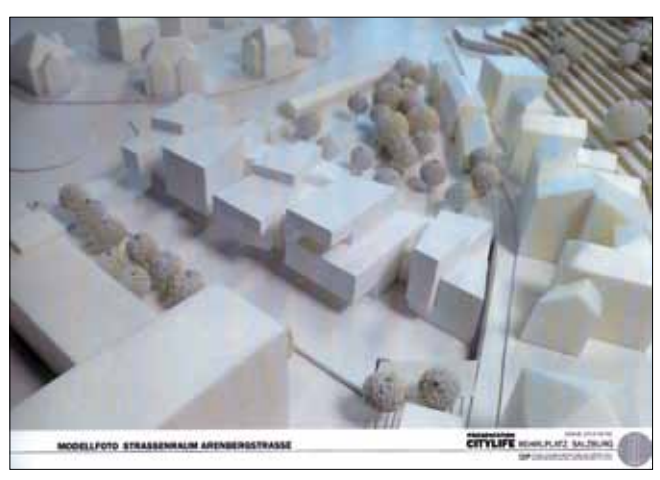
Rehrlplatz, model of the planned complex of buildings (status: April 2013)

structure is meant to be an architectural "signal" for the square in front of the station. The ICOMOS advisory mission pointed out that the "skyline" of the city of Salzburg does not need any highrise buildings, as it is already characterised in an exceptional way by the near and distant mountains, the steeples and domes of the churches as well as by the fortification Festung Hohe Salzberg on Mönchsberg. Under these circumstances a development with additional high-rise structures in the historic urban landscape of Salzburg and in the wider surroundings is hardly imaginable. A certain building height in the area of the station already exists with the Hotel Europa and the neighbouring buildings from the 1950s. Nonetheless, it does not seem compulsive that the planned new high-rise in Rainerstrasse must necessarily have the same height as the Hotel Europa, as suggested by the Architectural Advisory Board (Gestaltungsbeirat). The ICOMOS advisory mission therefore recommended that in accordance with the already approved development plan the height be reduced in relation to the 59-metre-Hotel Europa.