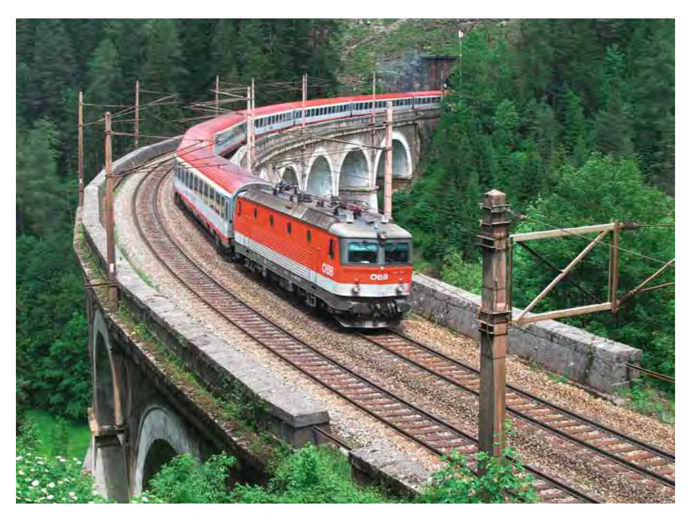
Semmering Railway viaduct Kalte Rinne