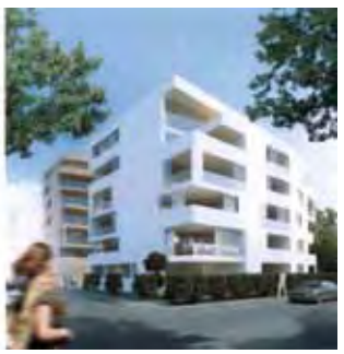
Visualisation north-east corner Schwarzstrasse (left), north-west corner Elisabethkai (right)

Another example of aggressive urban development in the historic centre of Salzburg is the project Priesterhausgarten in Paris-Lodron-Strasse. The Priesterhausgarten lies in the core zone of the World Heritage area and in protection zone I. The grounds behind the late medieval town wall in Paris-Lodron-Strasse became the property of the Priesterhaus in 1848. Today the grounds are used as access to the underground garage and to the neighbouring houses as well as a car park. The regrettable condition of this area bordered by the town wall and the wall of the Loreto monastery hardly shows that these are remains of a once important garden complex extending to the later Dreifaltigkeitsgasse. This early baroque garden laid out in 1630 was part of the primogeniture palace erected by Archbishop Paris Lodron: A view of the town (Philipp Harpff 1643) shows these gardens in the centre of the "Lodronstadt" erected by the Archbishop, including a precursor of the later Mirabellgarten – all in all a very important site for the World Heritage Salzburg, the historic view also showing a pavilion in the central axis which after a great