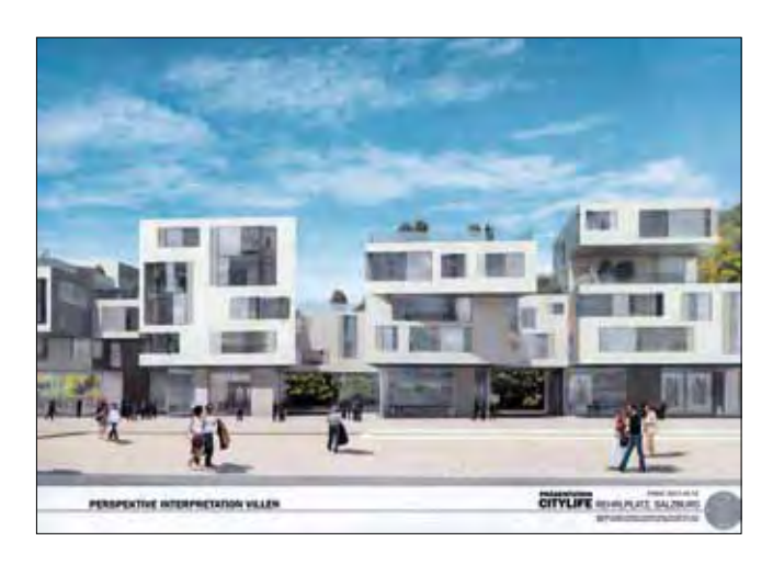
Rehrlplatz, design for new buildings (status: April 2013)