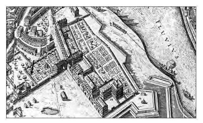
Ph. Harpff, map of Salzburg, 1643, detail showing the Priesterhausgarten. The arrow indicates the position of the grotto.