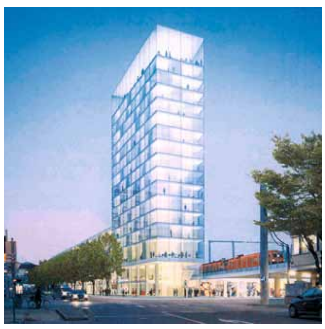
High-rise project Nelböck Viaduct Rainerstrasse/Bahnhofsvorplatz, visualisation

Another example of aggressive urban development in the historic centre of Salzburg is the project Priesterhausgarten in Paris-Lodron-Strasse. The Priesterhausgarten lies in the core zone of the World Heritage area and in protection zone I. The grounds behind the late medieval town wall in Paris-Lodron-Strasse became the property of the Priesterhaus in 1848. Today the grounds are used as access to the underground garage and to the neighbouring houses as well as a car park. The regrettable condition of this area bordered by the town wall and the wall of the Loreto monastery hardly shows that these are remains of a once important garden complex extending to the later Dreifaltigkeitsgasse. This early baroque garden laid out in 1630 was part of the primogeniture palace erected by Archbishop Paris Lodron: A view of the town (Philipp Harpff 1643) shows these gardens in the centre of the "Lodronstadt" erected by the Archbishop, including a precursor of the later Mirabellgarten – all in all a very important site for the World Heritage Salzburg, the historic view also showing a pavilion in the central axis which after a great