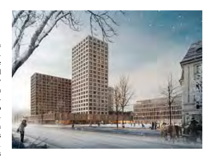
Winning design for the "new" Hotel InterContinental

There is not much hope that the City of Vienna will learn from the negative experiences with the Wien-Mitte project (see H@R 2002/2003, p. 42 f.) and the high-rise projects behind Belvedere Palace and near Schönbrunn (see H@R 2008–2010). Compared with the famous Canaletto view of Vienna the visual integrity of the historic centre with the tower of the Stephansdom seen from the Upper Belvedere could now be ruined by another highrise project. The development project "Vienna Ice-Skating Club - Hotel InterContinental - Konzerthaus" lies in the World Heritage zone in the area of the Vienna Ice-Skating Club between Hotel InterContinental (opened in 1964) and the Konzerthaus (opened in 1913, a building by architects Fellner and Helmer). With regard to this project the World Heritage Committee at its 37th session in Phnom Penh in 2013 urged the State Party "to halt any redevelopment higher than existing structures until an evaluation has been made by the Advisory Bodies". However, although in the international competition there were proposals that would have respected the visual integrity of the World Heritage, the first prize-winning design by the Brazilian architect Isay Weinfeld presented on February 27, 2014, a 73 metre-tall building, is another provocation by the high-rise lobby. This design would seriously harm the nearer surroundings and the entire silhouette