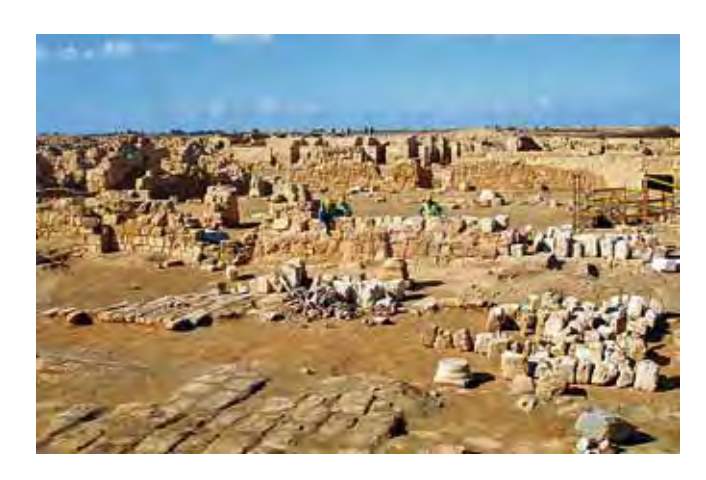
Abu Mina, view of the archaeological site