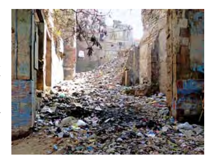
Cairo, Darb al-Ahmar, empty plot

The historic components of Cairo, World Heritage since 1979, consist of uniquely separate areas – the city's pre-Islamic origins