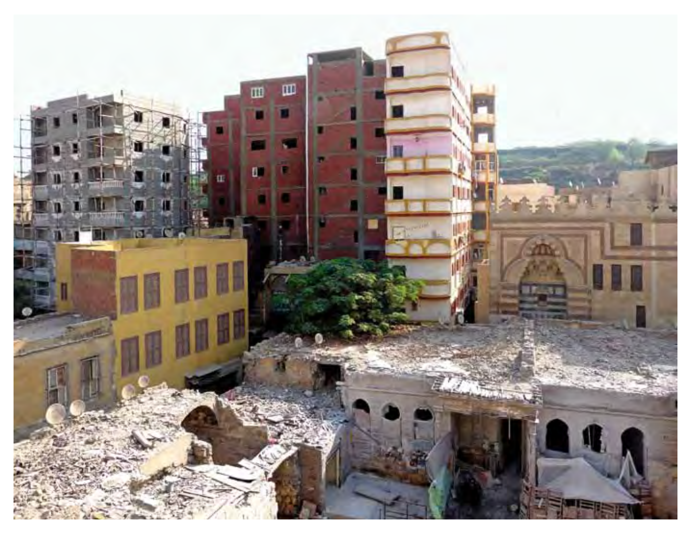
Cairo, Darb al-Ahmar, new buildings next to the historic mosque of Aslam al-Silahdar

in the south, the Citadel, the largest and best-preserved fortification in the Middle East, and the residential area between the two cemeteries. Historic Cairo has the largest concentration of Islamic monuments in the world. It occupies a stretch of 3.87 square kilometres of urban fabric accommodating about 320,000 inhabitants. This area includes 313 listed monuments.