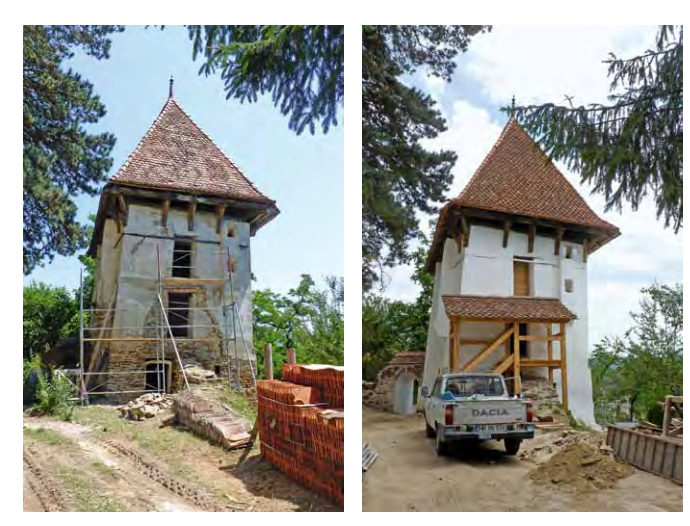
Apold/Trappold, fortress before and after the restoration