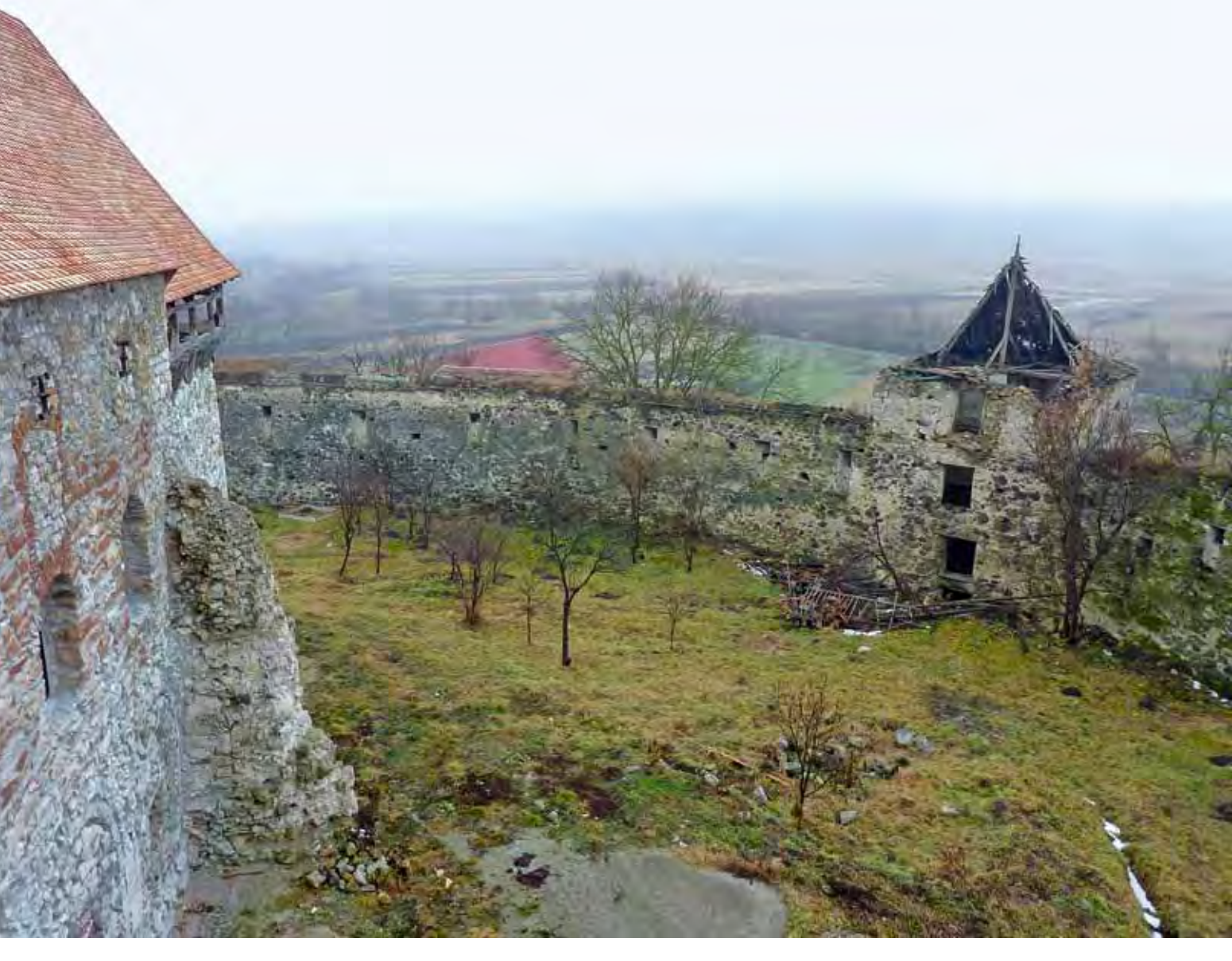
The fortified ensemble of Drăuşeni/Draas