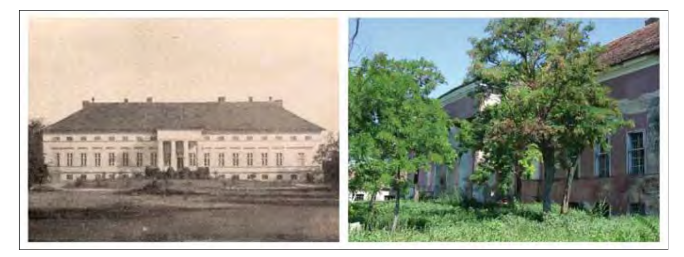
A first Baroque mansion was built at the end of the 18th century at the site of the current residence by the Foeni branch of the Aromanian aristocratic family Mocioni, after settling on the Foeni estate in Timiş County. Considered a trademark for the entire Foeni aristocratic branch, the ensemble was then completed and extended, and at the end of the 19th century it became one of the most imposing manor estates in the region. Given to the local community by the last descendent of the family, the ensemble is used until today as school, kindergarten and local cultural centre. Following the rainy season in 2005, the level of the Timis River, running close to the village, rose, putting pressure on the upstream dyke. On April 20, the dyke collapsed, and the flood affected even Mocioni Palace. The lack of ulterior restoration interventions increased the building's state of decay.

funds and more often because of the ignorance of authorities and the passivity of civil society, legislation is rarely put into practice. In these circumstances, the estates decayed at an accelerated pace in the years following the fall of the Communist regime.