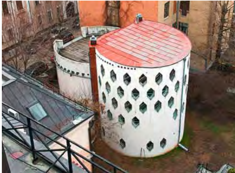
The Melnikov House and Studio, seen from above

(...) The pressure on the subsoil and the construction of underground garages in apartment buildings with levels minus 7-8mhas altered the hydrogeology of the site and deformed its drain-