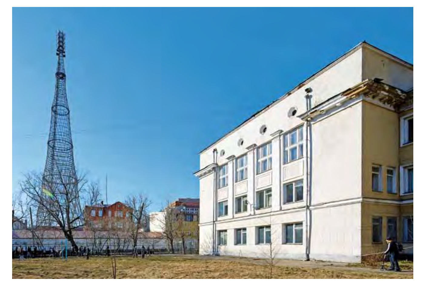
General view of the Shukhov Tower, 2014

In recent years, big efforts were made by the Shukhov Tower Foundation to preserve Vladimir Shukhov's heritage in Russia (see also H@R 2008-2010, p. 152). It is well known that the radio tower suffers from crevice corrosion and needs serious expertise and conservation. In 2011, Vladimir Putin allocated 135 million rubles ($ 3.8 million) for its restoration, but no action has been