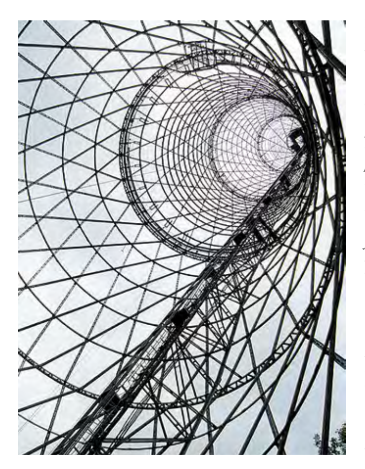
The Shukhov Tower seen from below