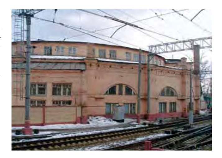
View of the Circular Depot today