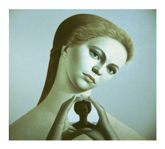
Fig. 6: Metka Krašovec, Trojno ogledalo (Triple Mirror), acrylic on canvas, 1992, 145 cm x 160 cm.