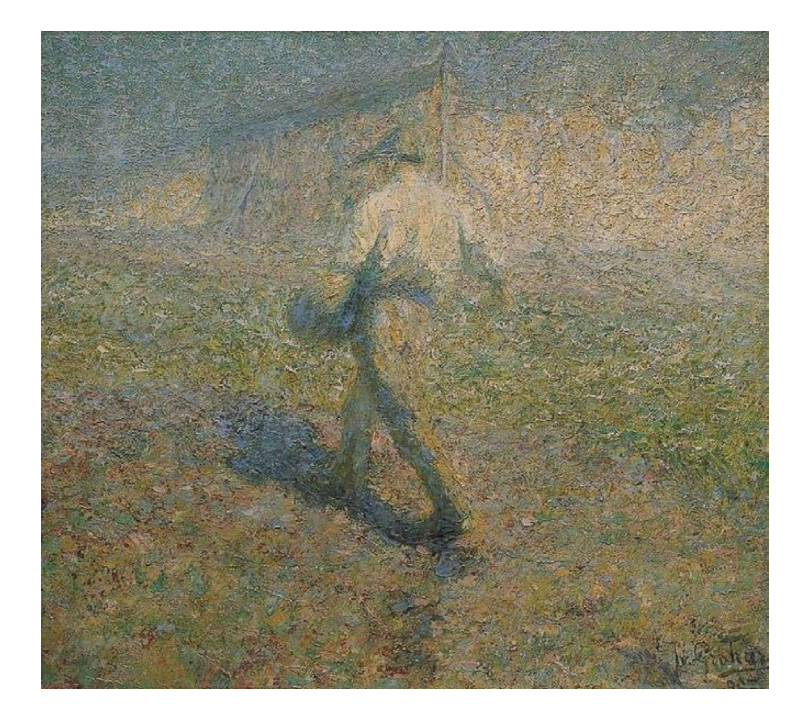
Fig. 8: Ivan Grohar, Sejalec (The Sower), Oil on canvas, 1907, courtesy of the National Gallery of Slovenia.

concern here, it would be evasive to avoid all mention of previous styles in favor of an analysis of the Galerija Equrna's place in Ljubljana's art scene, because that would avoid coming to terms with either the local or the international critical writing. So perhaps it is better to leave aside the historical settings proffered by critics and historians, and try to describe the work on its own terms.