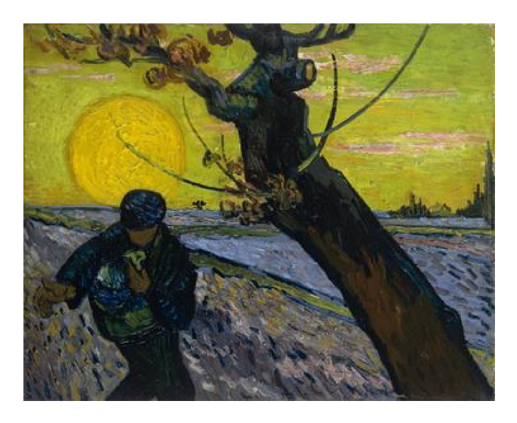
Fig. 9: Vincent Willem van Gogh (Schilder), The Sower. Arles, November 1888, oil on canvas, 32 cm x 40 cm, courtesy of the Van Gogh Museum Amsterdam (Vincent van Gogh Foundation).

the Barbizon School. It can seem that each country has its own sower, who is interpreted in terms of each country's sense of its heritage. In Austria, for example, there is Albin Egger-Lienz's (1868-1926) powerful The Sower ( Der Sämann , 1908). The coincidence in dates is often remarkable. In this case, Egger-Lienz was six years younger than Grohar, and painted The Sower one year later. In Grohar's case, the subject is associated with Slovenian work ethic. A sower is seen less as a symbol of the country's fertility than of the hard work necessary to make it fertile.