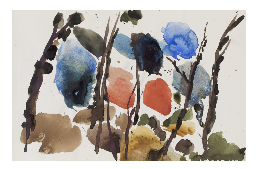
Fig. 11: Gustav Hessing, Landschaft (landscape), gouache on paper, 23.8 \text{ cm} \times 38 \text{ cm} , 1980, courtesy of the Leopold Museum, Vienna.

In one room Leopold has hung a series of flower paintings, including one by Egge Sturm-Skrila (1894-1943), another by Anton Faistauer (1887-1930), and a third by Anton Kolig (1886-1950), which shows evidence that Kolig was looking at Matisse. The pictures are modernist, but in parts also indifferent to modernism, as if they were answers to the question: If you like flowers, and you are a modernist in Austria in the 1930s, how can you paint? Together with Schiele, Faistauer and Kolig comprised the short-lived Neukunstgruppe, and that is enough to ensure their presence in art history. Sturm-Skrila is a more obscure painter.