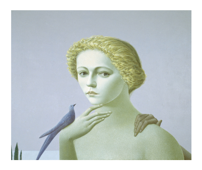
Fig. 7: Metka Krašovec, Čas (Time), acrylic on linen, 1992, 81 cm x 100 cm.