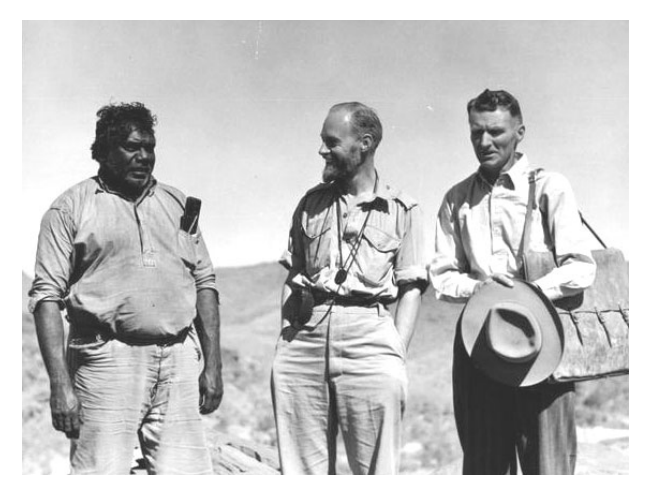
Fig. 3: Albert Namatjira (left) and Rex Batterbee (right).