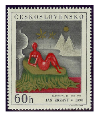
Fig. 5: Kleopatra on a Czech postage stamp.

In researching this article I have deliberately tried not to report on new, "important" painters. Part of the reason not do so is to avoid the nowcustomary mining of "exotic" places, and the entire imperialist agenda that it involves. Another reason is more philosophic. In Adorno's formulation of the avant-garde, it must remain possible that an avant-garde practice is initially unrecognizable. A recognizable avant-garde, one ready to be "discovered," is also one whose criteria of innovation are already in place. If I find someone like Zrzavý, and decide he is a potentially important artist, I am using criteria that I have learned elsewhere, and my "discovery" is really only a recognition of things I have already known, presented to me in a new combination or in an unfamiliar cultural context. This creates a contradiction that is itself formative for the inclusion of unfamiliar artists in the main trajectory. On the one hand, the prevailing rhetoric of multiculturalism and multiple modernities enjoins art historians to expand the canon; on the other hand, the only tools for achieving that expansion are themselves derived from avant-garde moments that are already part of the canon.