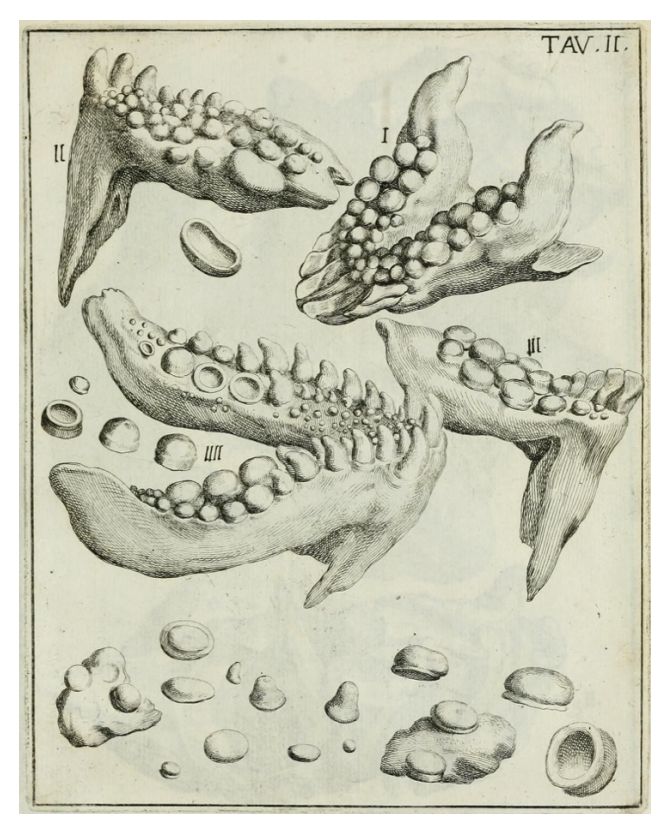
Figure 2: Scilla, La vana speculazione disingannata dal senso, plate II.

5. I will begin with an image: the front page of La vana speculazione disingannata dal senso (figure 1) (Empty speculation disproven by senses). The author of the book, published in Naples in 1670, as well as of the etching facing the frontispiece, was a painter, Agostino Scilla. Born in Messina in 1629, he died in Rome in 1700. His long-term fame was remarkable; his Vana speculazione, dealing with fossils and their origin, was translated into English, possibly plagiarized, and quoted by Leibniz in his posthumously published Protogaea. Some recent, remarkable essays by Paula Findlen have thrown much light on the context in which Scilla wrote his book, as well as on the reception of his book in England. 12