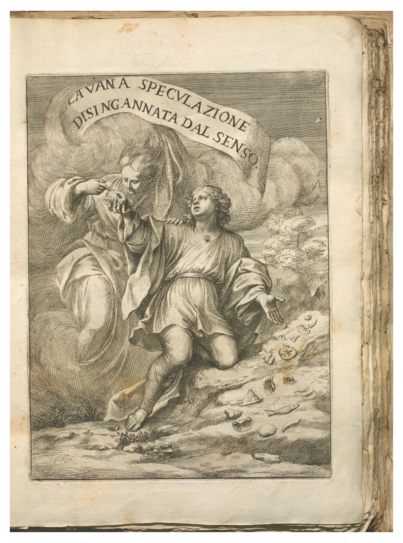
Figure 1: Agostino Scilla, La vana speculazione disingannata dal senso (Napoli: Colicchia, 1670), frontispiece.

Innumerable examples would prove that history as social memory and history of social memory are not synonymous. "Unlike history proper" Jan Assmann wrote "mnemohistory is concerned not with the past as such, but only with the past as it is remembered". I would translate this definition as follows: mnemohistory is concerned with a remembered past, as a topic belonging to the emic, not to the etic dimension. But I wonder whether this translation would be compatible with Assmann's suggestion that mnemohistory is a branch of history, "but it deliberately leaves aside the synchronic aspects of what it is investigating". <sup>10</sup> In the case study I am going to deal with I will argue for the opposite.