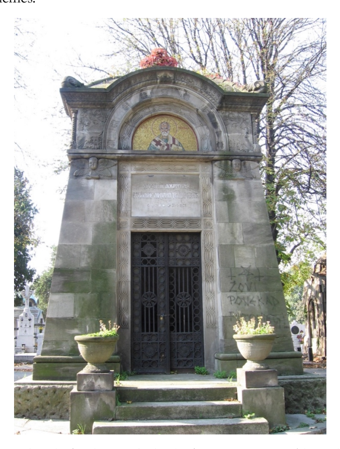
Figure 8. Chapel of Velimir Mihailo Teodorović, Novo Groblje, Belgrade, from: the private collection of Violeta Obrenović.

In 1927, a chapel was erected at Belgrade's New Cemetery in the Alley of the Greats in honor of Velimir Mihailo Teodorović (1849–1898), a Serbian benefactor and the extramarital son of the Prince Mihailo Obrenović (Fig. 8). The chapel was built in Serbian Byzantine style with elements of late Secessionism.<sup>48</sup> The base of the chapel is built in the style of an Egyptian temple while the upper part shows a floral and simple ornamentation and decorations partly inspired by Christian themes.