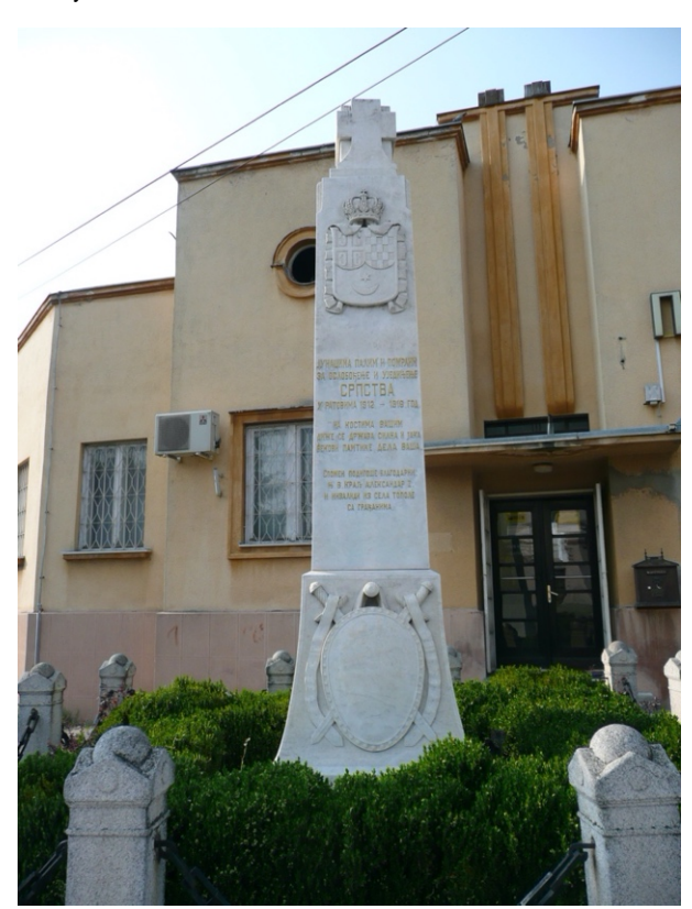
Figure 10. Memorial in the city of Topola, from: the private collection of Violeta Obrenović.

from blocks of artificial stone in the shape of a pyramid, approximately 16 meters in height.<sup>51</sup> The consecration was performed in the presence of Serbian Orthodox Church representatives, former Gučevo soldiers, families of fallen soldiers, and representatives of the king, government and army.<sup>52</sup> The text on the monument was taken from "The Mountain Wreath" written by Petar II Petrović Njegoš: "Blessed is he who lives forever, he had a reason to be born" ("Благо оном ко довијека живи, имао се рашта и родити"), alluding to the topic of immortality or the afterlife.