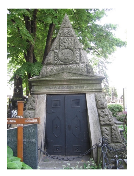
Figure 6. Nušić's home (1922) at Novo Groblje, Belgrade from, the private collection of Violeta Obrenović.