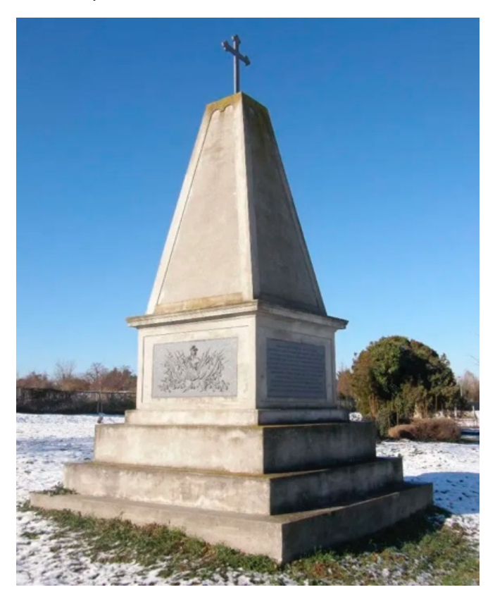
Figure 1. Monumental memorial dedicated to soldiers killed during the Revolution of 1848 and 1849, from: the private collection of Kristijan Obšust.

often in the form of a high obelisk.<sup>29</sup> The surface on top of the crypt at such tombs is usually planted with different vegetation or covered with a grave slab made from granite or marble. The highest concentrations of tombs featuring monumental obelisks can be found in Almaško (Fig. 2), Uspensko (Fig. 3), and in the Roman Catholic Cemetery Complex, although they are also common at Trandžament cemetery.<sup>30</sup>