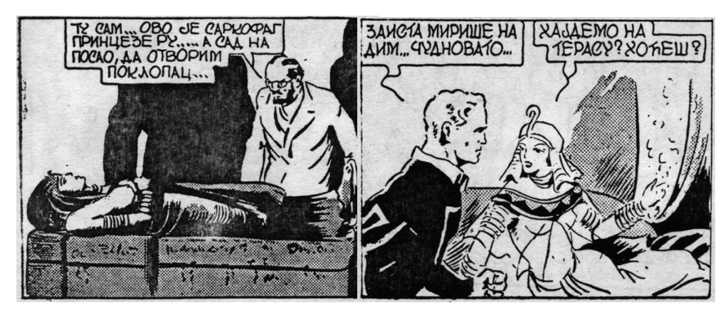
Figures 11, 12. From the comic "Princess Ru" by Đorđe Lobačev, from: Pegaz, specijalni broj 2, (1989): 30, 57.

necessarily have to be rooted in orientalist stereotypes,<sup>79</sup> but in the more general tendency of exaggerated gender characteristics in comics. Narratives like Princes Ru, which in this context acts as a metaphor for the passiveness of femininity in stereotypical Egypt and adjacent areas are not new and are quite common in products of pop-culture prevalently produced by men for men.