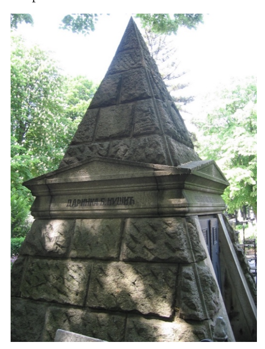
Figure 7. Nušić's home: a side view, from: the private collection of Violeta Obrenović.