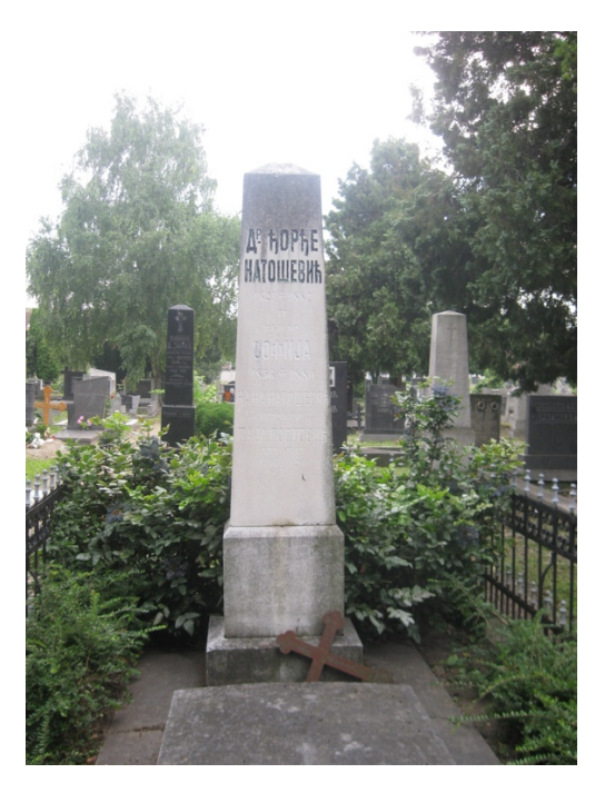
Figure 3. A grave at Uspensko cemetery, Novi Sad, from: the private collection of Kristijan Obšust.