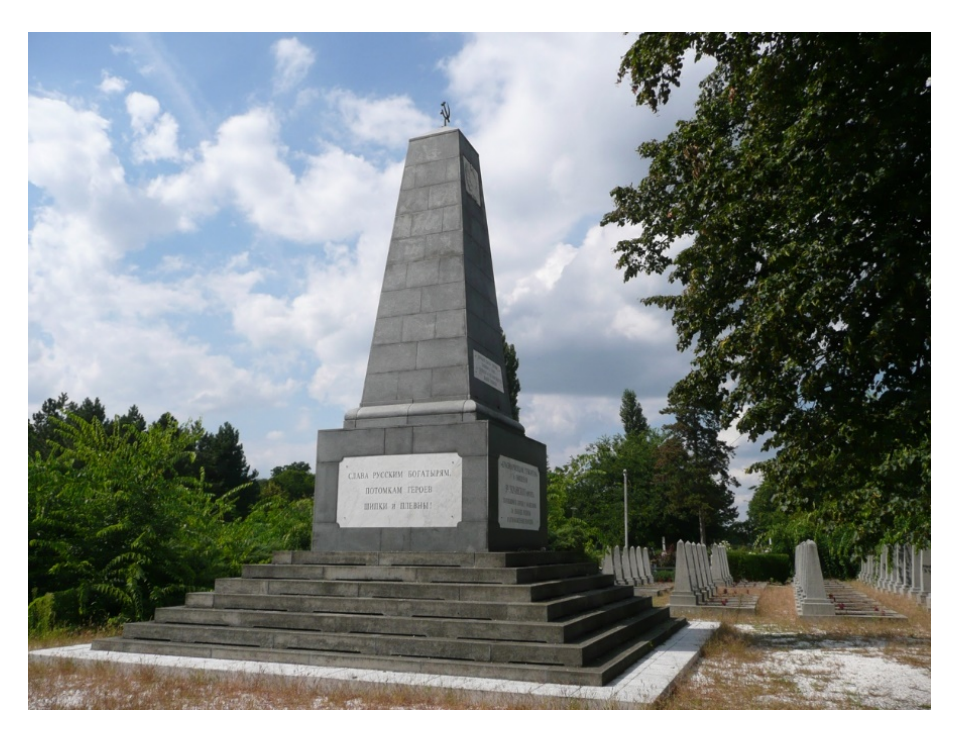
Figure 5. Memorial at the cemetery in Subotica, the private collection of Violeta Obrenović.