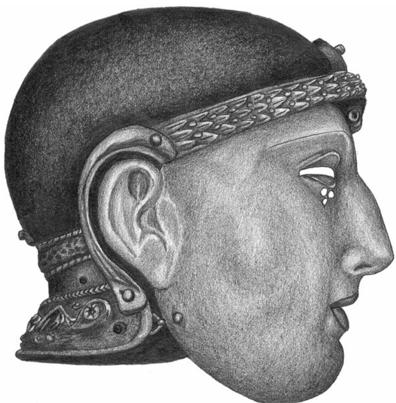
Fig. 3 Helmet from Homs (ancient Emesa/SYR). – (Drawing E. Szewczyk).