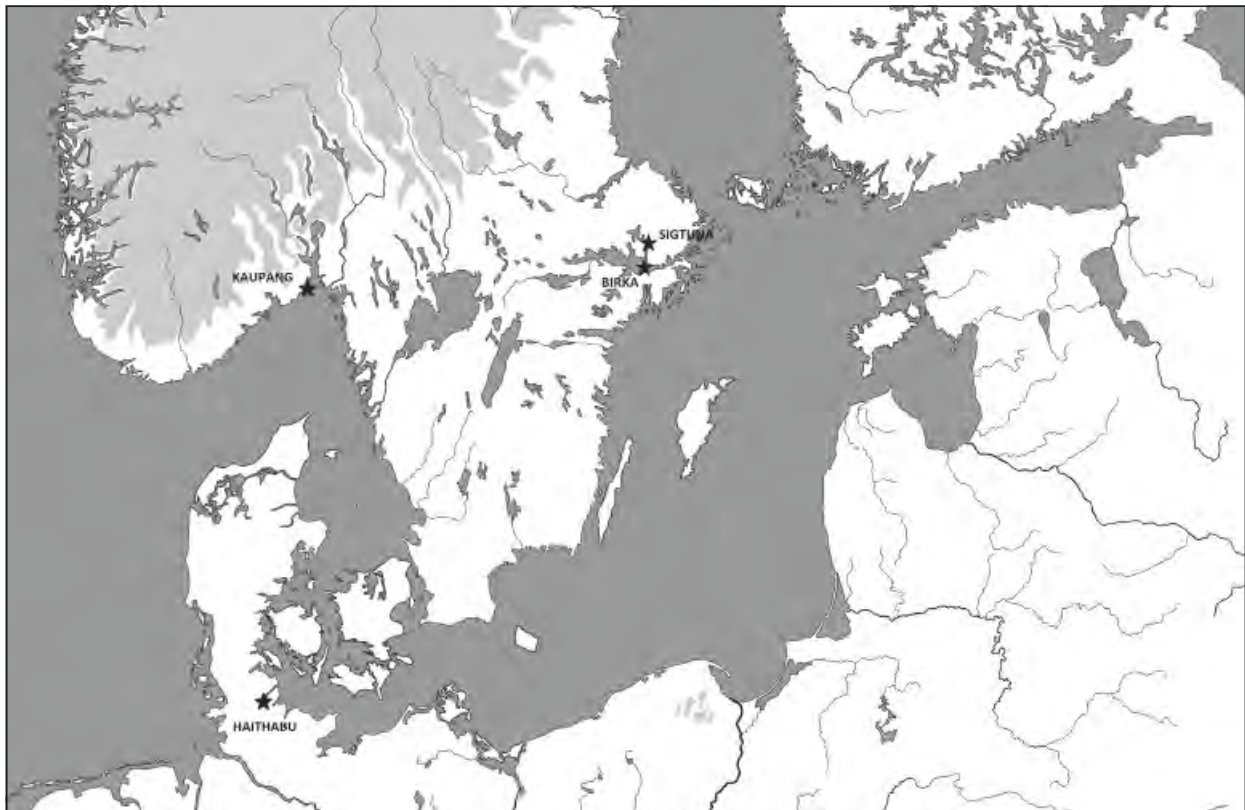
Fig. 1 The Baltic Sea region with the locations of the emporium mentioned in the article. – (Map J. M. Schultzén).

have spread rapidly throughout the affected trade network in order to uphold an acceptable base for trade, especially in a pronounced weight economy. In the second half of the 9 th century such a transition swept through the Baltic Sea region (Steuer 1987a, 462; Sperber 1996, 104f.). Over a time period of probably no more than a few decades a new weight system was adopted in an area spanning the Volga Bulgars in the east and certainly as far as Haithabu (Kr. Schleswig-Flensburg/D) and Kaupang (fylke Vestfold/N) in the west.