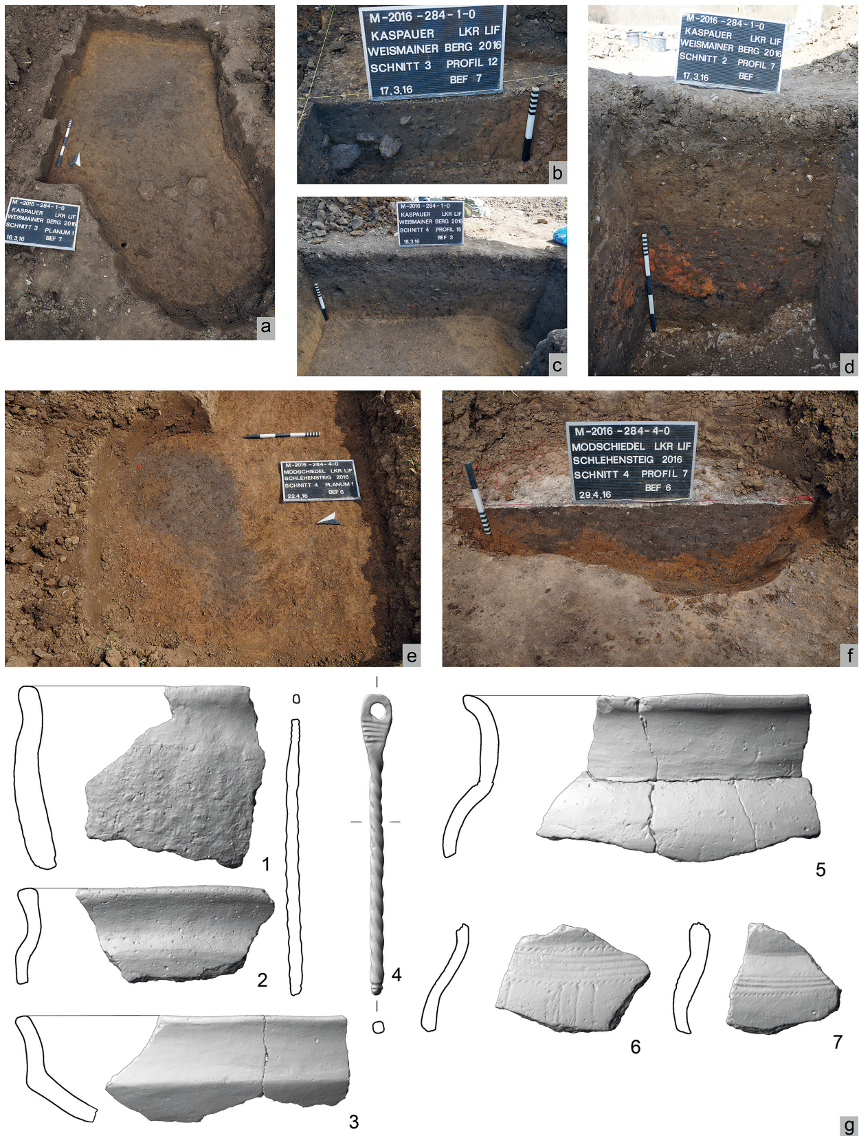
Fig. 3 Archaeological features and finds: a Kasp452: feature 7 (northern pit) in planum 1. – b Kasp452: feature 7 (northern pit) in profile. – c Kasp452: feature 3 (northern pit) in profile. – d Kasp452: feature 6/9 (southern pit) with burnt clay below a colluvial layer in profile. – e Mods1205: feature 6 in planum. – f Mods1205: feature 6 in profile. – g finds: 1-3 Kasp452: pottery; 4 Kasp452: bronze pendant; 5-7 Mods1205: pottery. – (Photos T. Seregély). – 1-3, 5-7 scale 1:2; 4 scale 1:1.