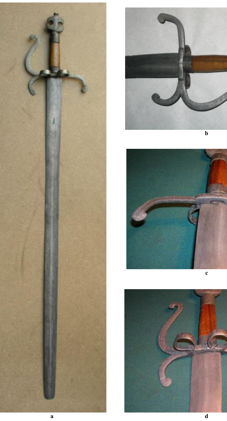
Fig. 1. Item No. 1073, general view and details.