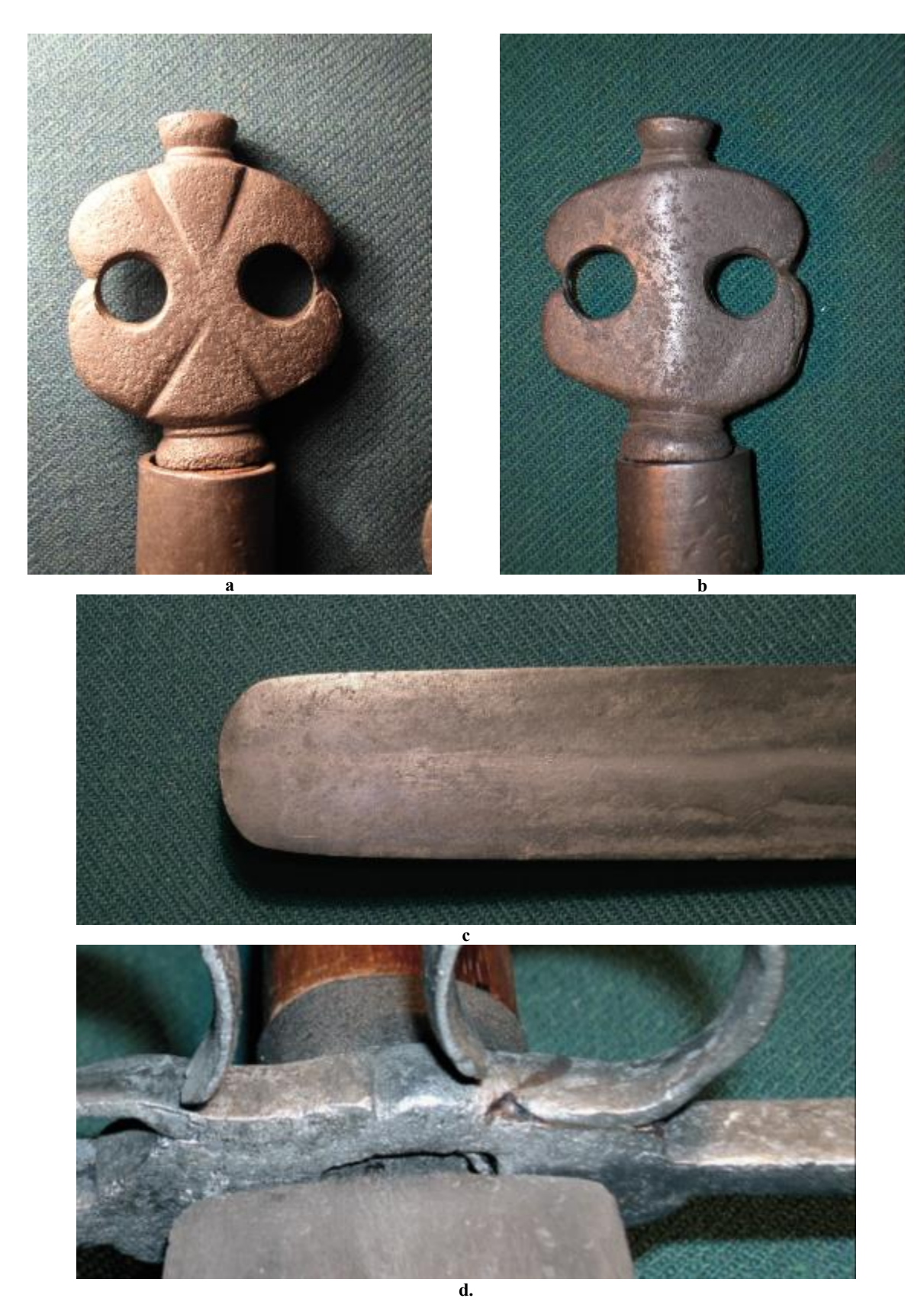
Fig. 2. Item No. 1073, details.