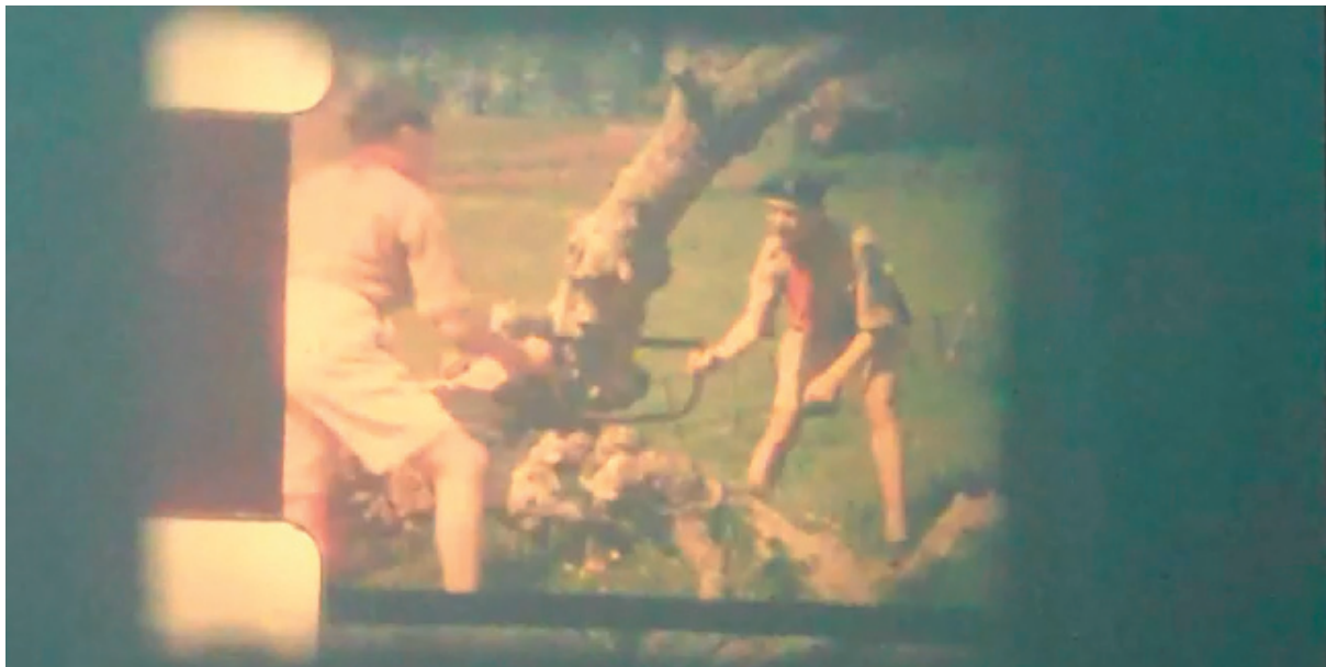
Figure 3 Still from video of projection of Ken Jones' 1950s Scouting Standard 8 film, Know Your South Bristol, June 2012.