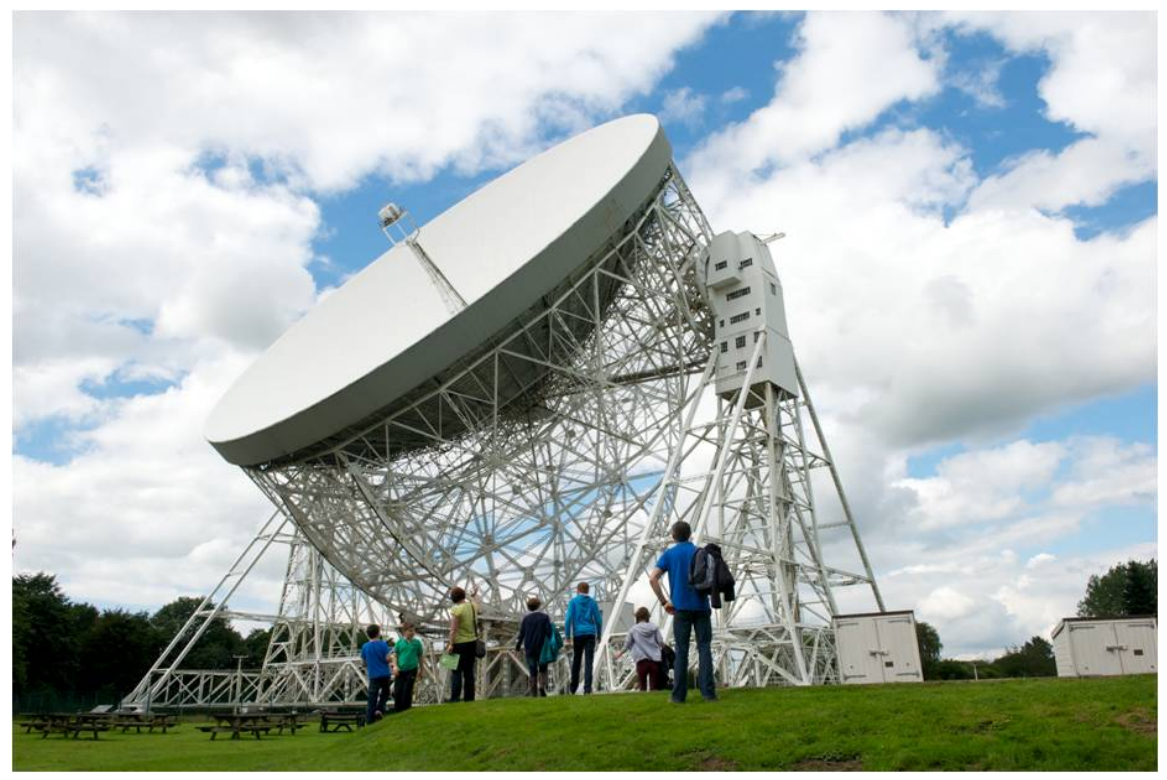
The Lovell telescope at Jodrell Bank, part of e-MERLIN.

and therefore further back in time. They can also image the sky with a higher resolution, thus improving our view on the universe.