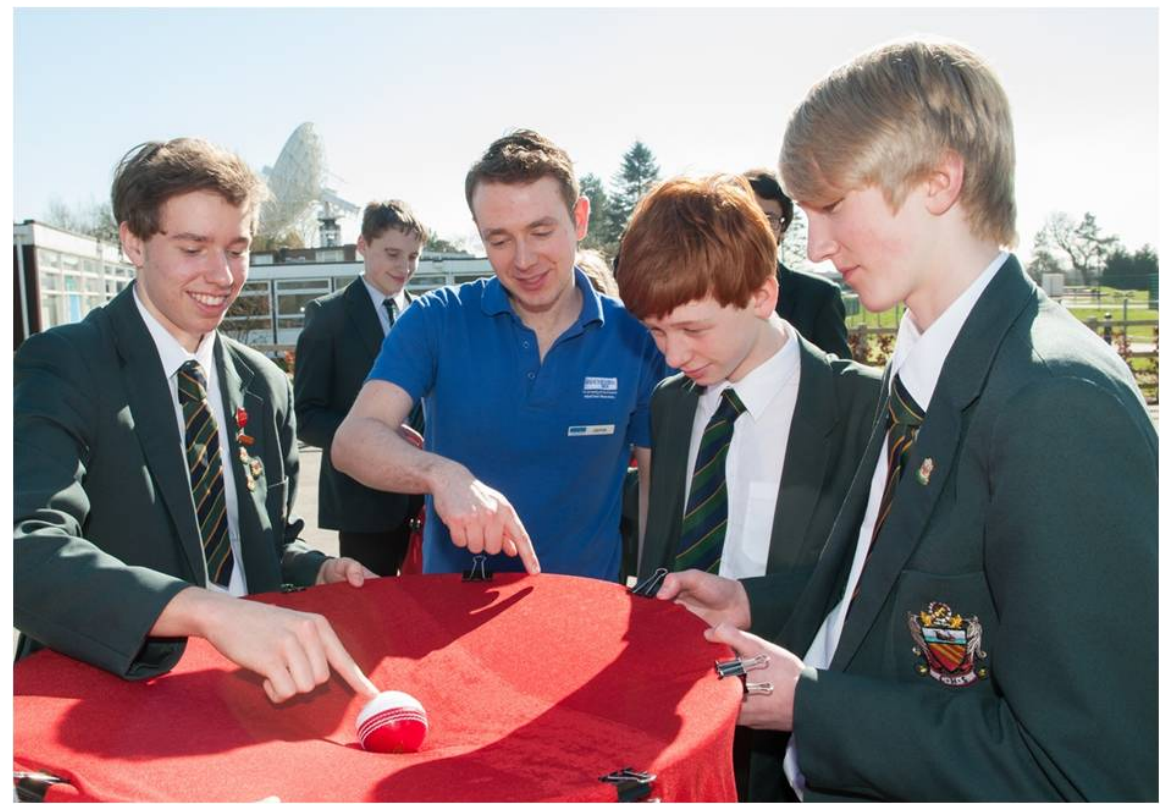
Part 3 being demonstrated.

around the weight, you will see that they follow a curved path – they are orbiting!