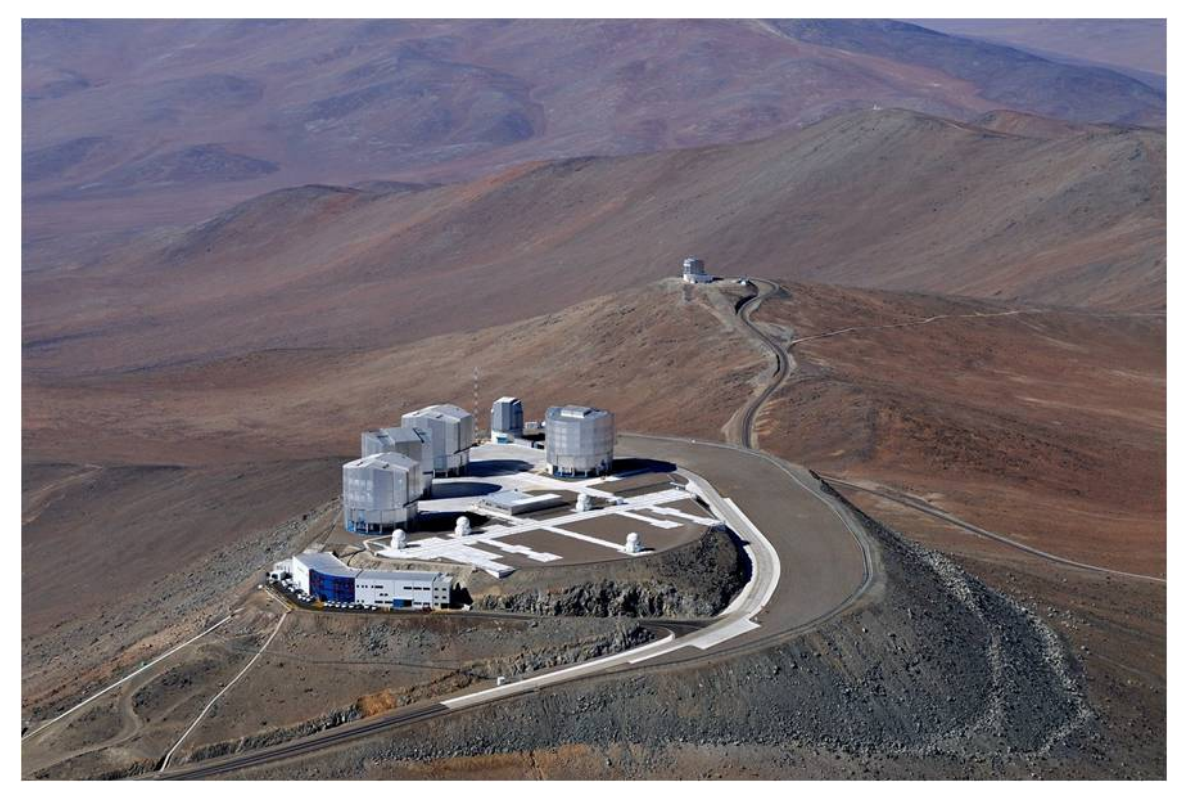
Bird's Eye View of the Very Large Telescope.

In the second section of the lesson, students are briefly introduced to some of the big telescopes around the world (and in space). They are also presented with some of the astronomical questions relating to gravity that are still being investigated by astronomers.