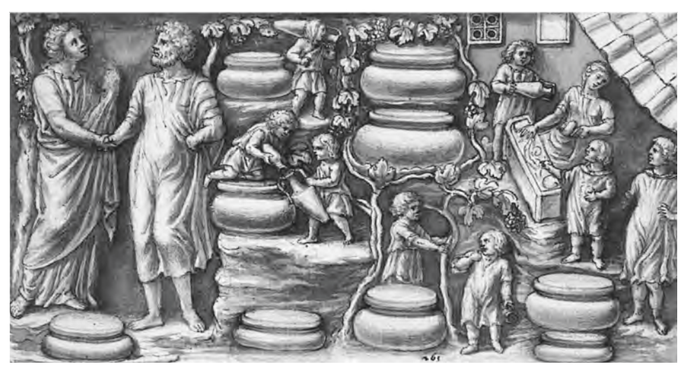
Fig. 2 (opposite page) Etching of the Vintner Relief. From Engravings and Etchings at Ince (1809/1810). Fig. 3 (above) Drawing of the Vintner relief from the Museum Chartaceum, early seventeenth century.

Being of porous material, wine amphorae were coated with sealants, such as pine pitch, wood tar and resins. Osier casings protected their relatively thin clay walls from breaking. All amphorae required airtight stoppers to close their mouths and protect the contents. Bungs were made of raw clay, cork or wood. Since none of these provided a perfect seal, each would be smeared over with a heavy layer of lime-based mortar or beeswax. With a capacity of just over six gallons, the amphora was a standard container admirably suited both for storage prior to sale and transportation by sea to distant markets.