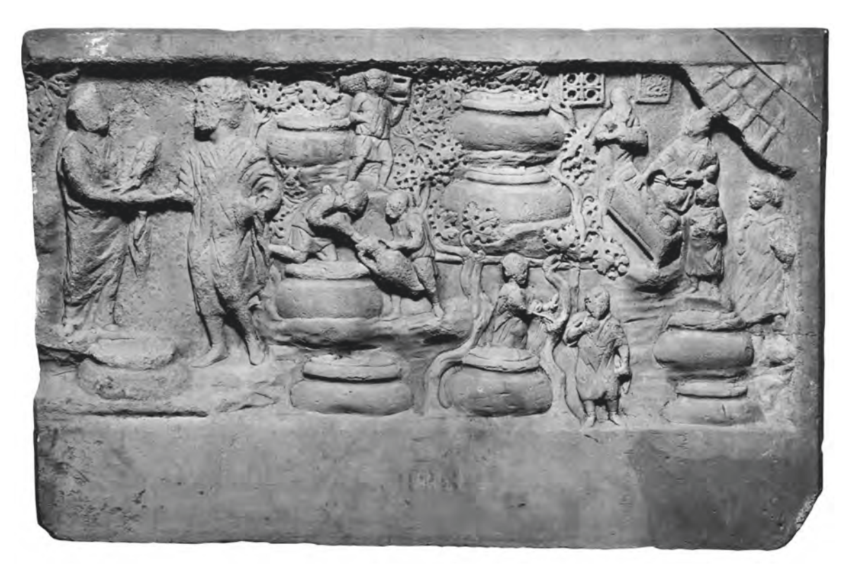
Fig. 1 Liverpool, National Museums and Galleries on Merseyside, Ince Blundell Collection, funerary relief of a vintner.

hand; her right hand clasps that of a bearded man facing her (fig. 4). He wears boots and a loose tunic with a small cloak draped over his left arm. In his left hand, he holds a scroll. Behind him springs up a vine stalk in full leaf. The comparatively large size of the couple indicates that they are the principal subjects of the carving, and in this context, we can conclude that they are the proprietor of the vineyard and his spouse<sup>9</sup>.