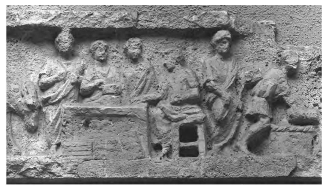
Fig. 8 Calculating the grain yield. Cast of a detail from the southern frieze of the Tomb of Eurysaces. Rome, Museo della Civilità Romana.

The Ince marble exhibits distortions of size and flattened perspective so that figures, actions and objects – whether near or far, can be seen clearly. The huge size of the dolia, overwhelming the tiny workmen, shows not only the hierarchical importance of the wine over its attendants, but also the scale of the winery – and by inference, the wealth of the owner. This relief is a typical example of 'arte plebea'33. The concept of 'arte plebea' is still alive and well but termed differently. Peterson's book of 2006 defines it as "freed-man art". Kleiner also uses the term in her book on Roman Sculpture. Chief characteristics of this genre are: episodic storytelling, multiple appearances of the protagonist, elevation of his status through increased figure size, and finally, wealth of realistic detail and coarse execution.