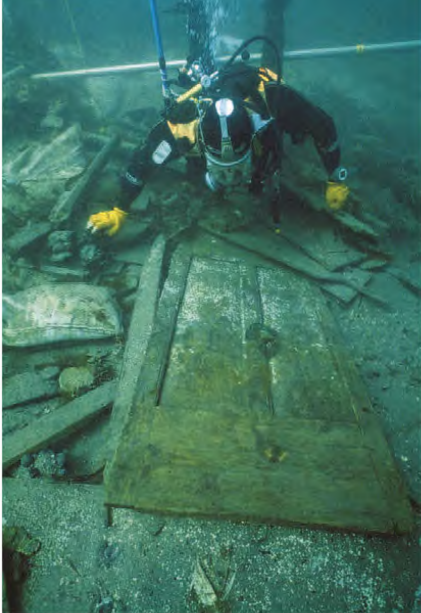
Duart Point, Sound of Mull. Diver inspecting the large, panelled door.