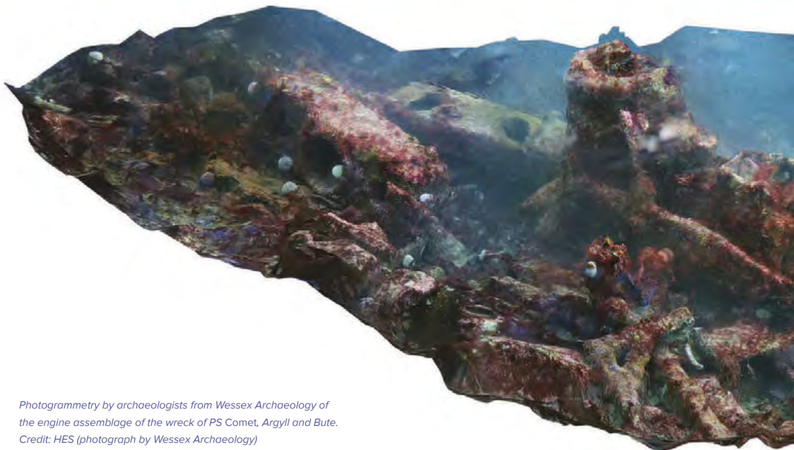
Photogrammetry by archaeologists from Wessex Archaeology of the engine assemblage of the wreck of PS Comet, Argyll and Bute.

November 2023 marked the 10th anniversary since the creation of Scotland’s first Historic MPAs. The experience has mostly been positive, and we now have eight designations in place, with three others