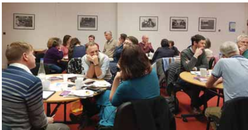
Advisory Council discussing the feedback from the committee participation survey.

If you'd like to know more about getting involved in ClfA committees and Groups, please contact admin@archaeologists.net