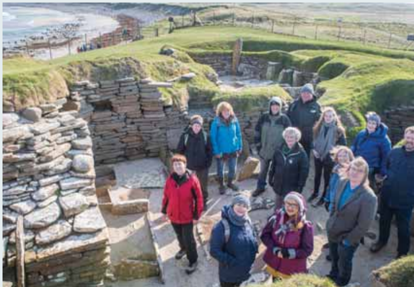
The Climate Vulnerability Index workshop in April brought international experts and the local community together at the Heart of Neolithic Orkney World Heritage site to pilot this methodology on a cultural heritage site for the first time. The results were presented at the 43rd WHS Committee in Baku, Azerbaijan in June (see article on p21 for more about this).

Defra on a template to help other heritage organisations undertake their own reporting. We would encourage any organisations interested to do so and would be happy to share our experiences.