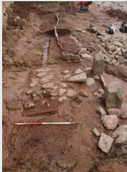
Excavations at the buried village of St Ishmael's, Carmarthenshire, exposed by coastal erosion.