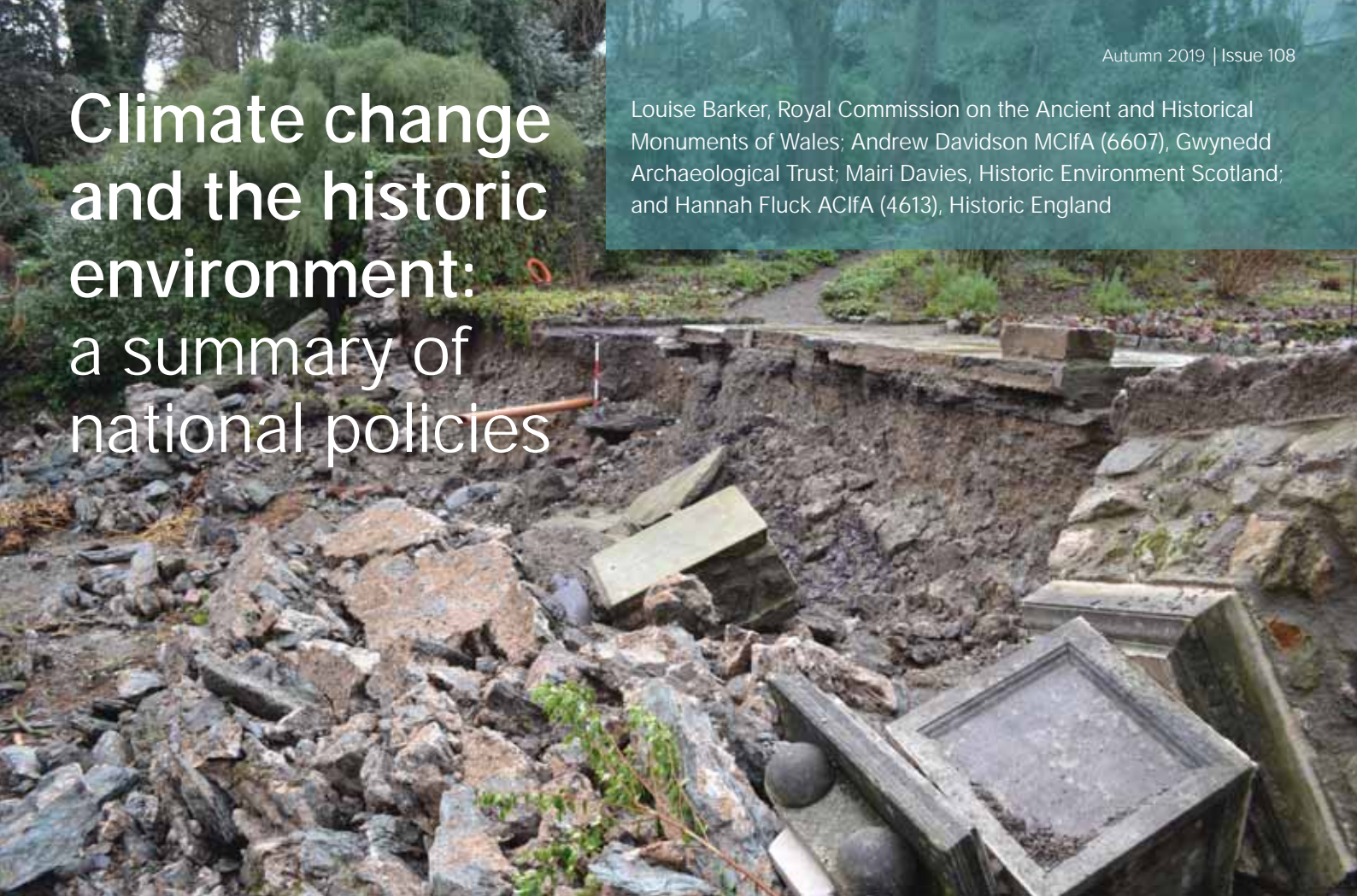
Damage at Plas Cadnant historic gardens, Anglesey, following excessive rainfall in 2017.

Climate change and heritage are policy areas devolved to the Scottish and Welsh governments, meaning that each UK nation approaches both independently. While there may be some subtle differences, certain key points remain the same. Similarities stem from the UK Climate Change Act 2008, which set a target for the UK to reduce targeted greenhouse gas emissions to 80 per cent of the 1990 baseline by 2050. It also established the Committee on Climate Change (CCC), an independent statutory body whose purpose is to advise UK government on emissions targets, and which includes an Adaptation Sub-Committee. The Committee publishes the Climate Change Risk Assessment every five years – the next will be in 2022. 1 In addition, each of the constituent countries derives information from the UK Climate Projections produced by the Met Office. The most recent were produced in 2018 and are referred to as UKCP18. 2