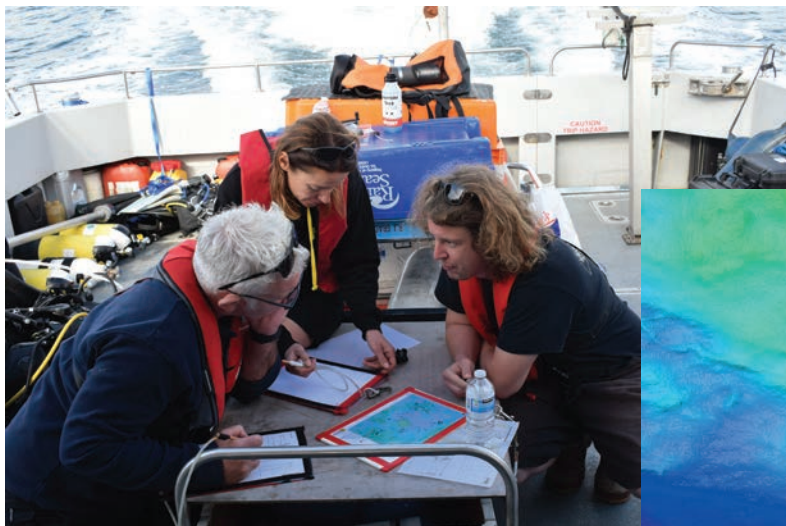
Divers filling out cannon recording sheets; scans of these were part of the project archive.