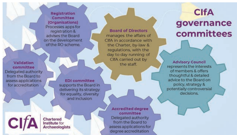
infographic showing the relationship of the ClfA governance committees

indeed join the AC to see what change you can bring about? I have had such an amazing experience; I hope you get your chance too.