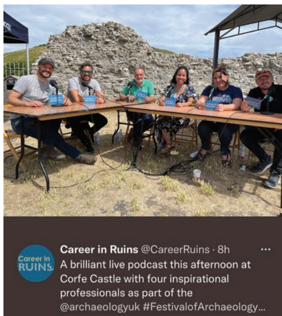
Volunteering with ClfA extends your network and opens up opportunities.

You don't need to be a part of a committee to volunteer; Groups are very happy to hear from people who would like to help on a specific project.