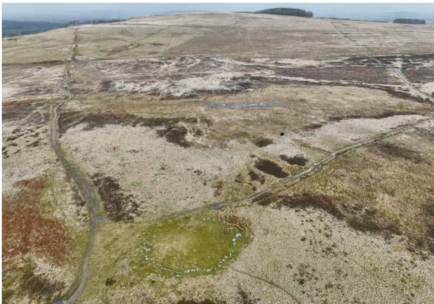
Drone survey of stone circle and adjacent peatland (centre) prior to coring for environmental evidence.

For example, pollen datasets have been collated, digitised, and new Bayesian chronologies created to improve cross-site correlations. These are being used, in tandem with data collated from HER records, to develop landscape scenarios for hydrological models looking at changing run-off and flooding through time. A targeted programme of coring will refine these models by detailing the transition of wetland environments in the study area. In addition, the rich data provided through all archaeological sources, such as cores, bones and monuments, are being used to develop local landscape scenarios from the Neolithic