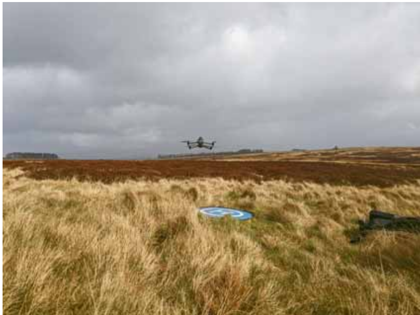
Drone landing after high resolution surface survey in bad weather.

environmental interdependencies develop over different temporal scales, observing periods of environmental resilience and crossings of ecological thresholds. It also enables us to engage with and communicate a narrative of a shared past to communities whose involvement and support is vital for successful future solutions.