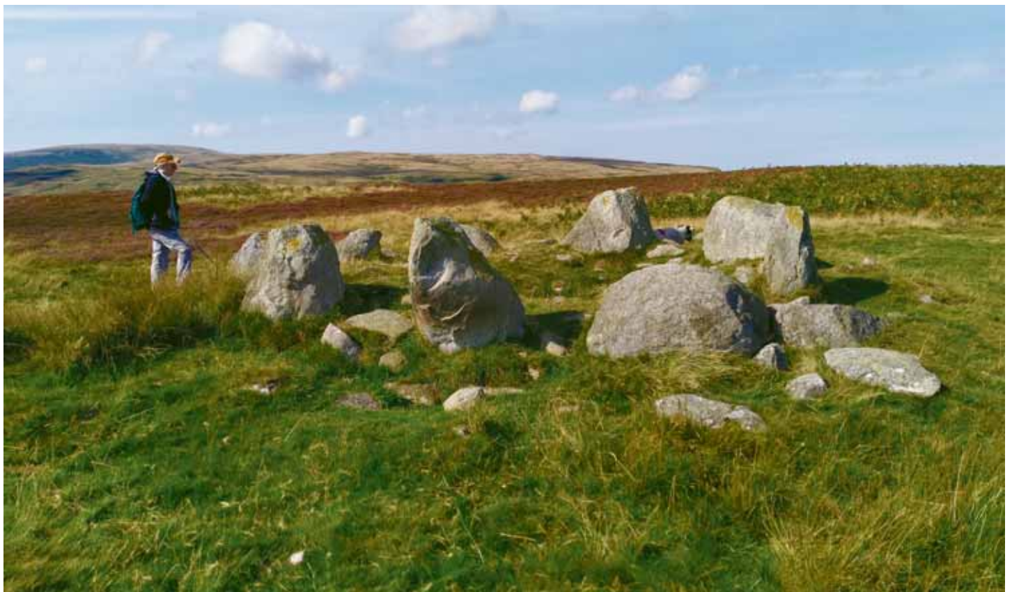
Ring cairn in archaeological landscape to be used for hydrological modelling.