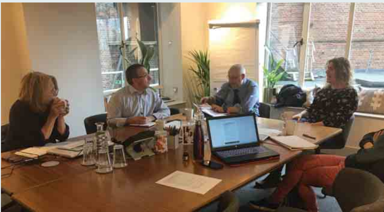
Archaeology Collective team meeting in Leeds.