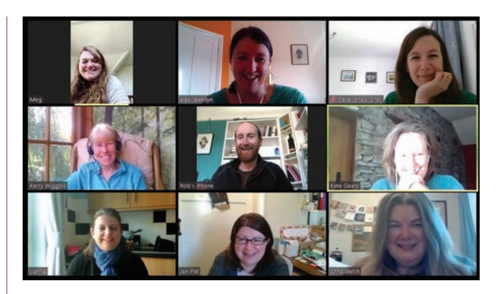
Adapting to remote working: ClfA staff having a regular online team catchup.

We trialled a recent digital workshop looking at ClfA accreditation, funded through our Historic Environment Scotland grant. We are sustaining this momentum by expanding our digital learning programme and are preparing a number of digital workshops and training opportunities. These range from live digital workshops and webinars to expanding our suite of e-learning modules.