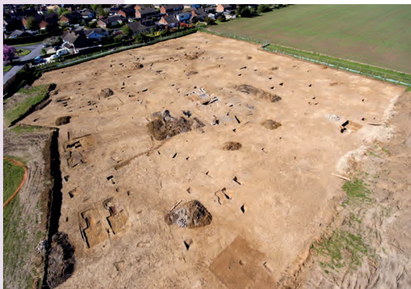
Figure 1: Cholsey phase 1 excavations

ANDREW HOOD MCIFA, FOUNDATIONS ARCHAEOLOGY