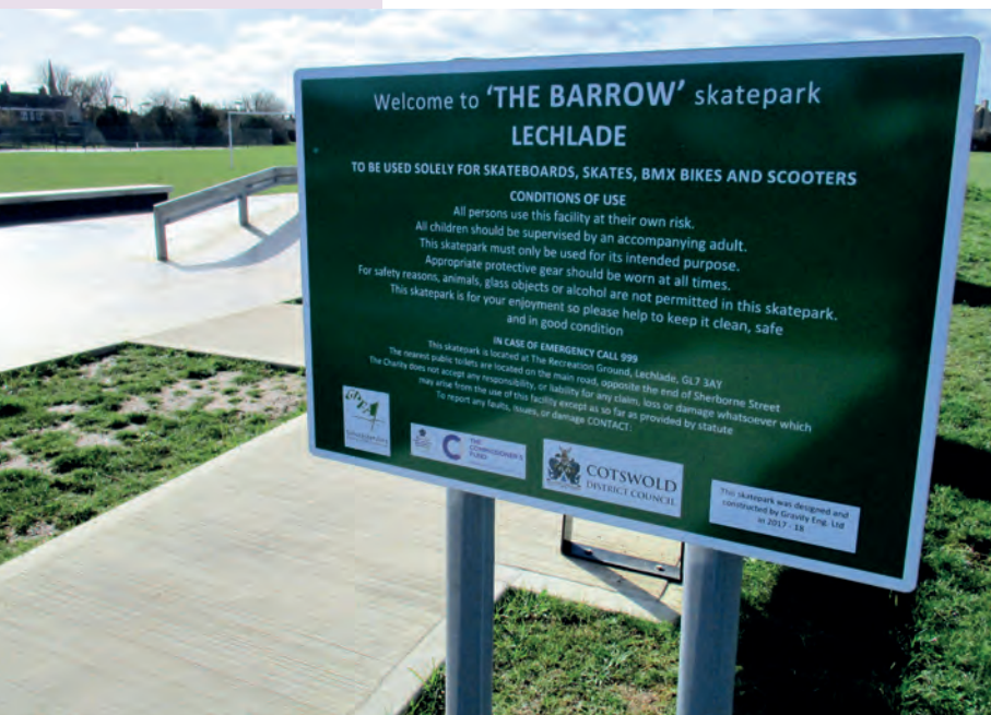
Figure 6: The Barrow skate park

on BBC Radio Gloucestershire. As with the Cholsey site, it was clear that people were very interested, not only in the barrow, but also in the process of excavation. People of all ages, genders and backgrounds would frequently come to site for updates and discussions. The positive interaction between the archaeologists and the public was key to success here.