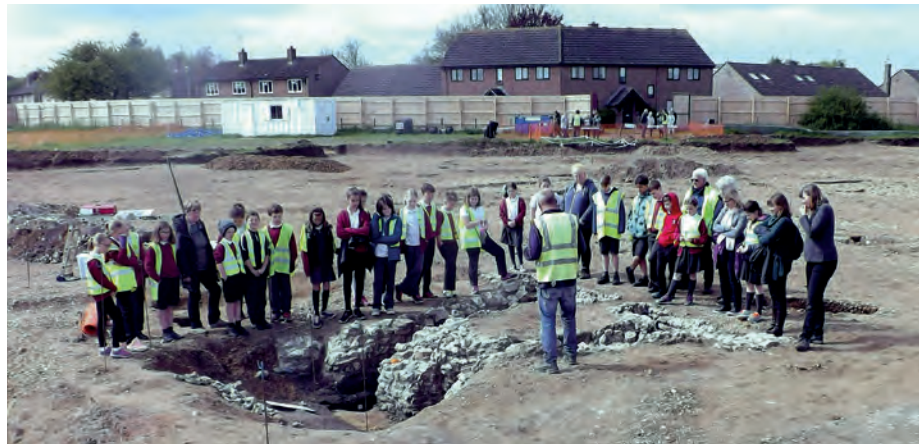
Figure 3: Kids and corndryers