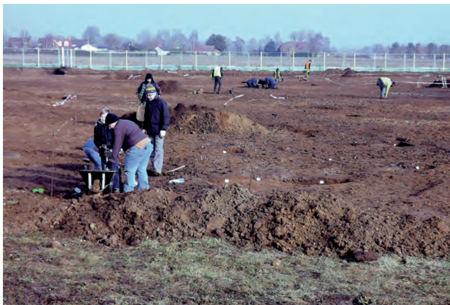
Figure 2: Members of The Wallingford Historical and Archaeological Society (TWHAS) excavating at Cholsey

In light of these parameters, the area around the villa was designated 'an area of play' within the development plan and was not subject to below-ground disturbance. Moreover, the area was 'mounded-up' with topsoil in order to create sufficient overburden to hinder metal detectorists. Subsequent to the completion of the housing development, a permanent