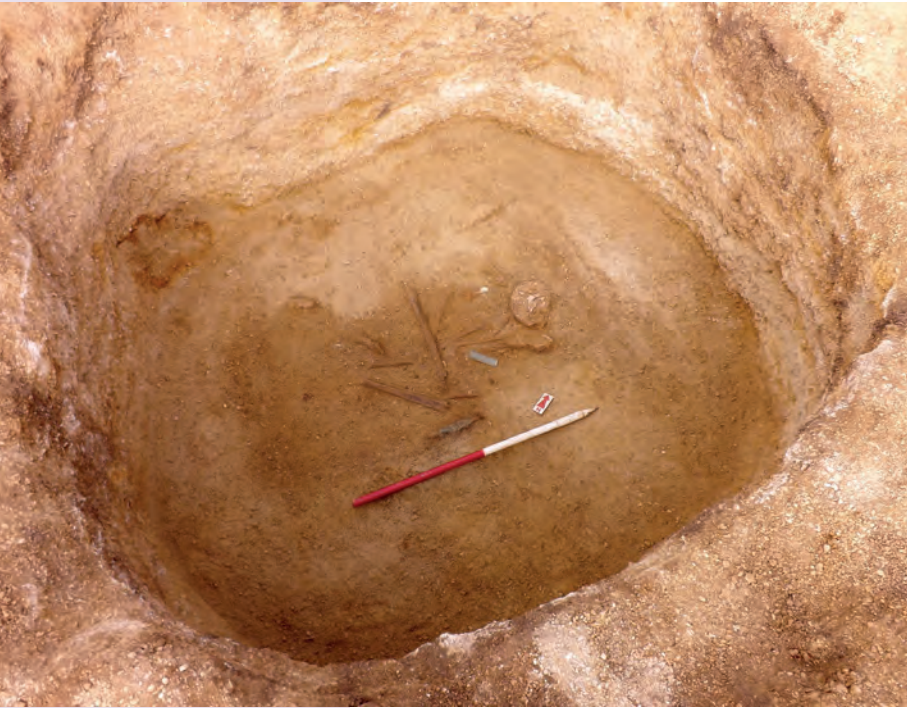
Figure 5: The primary burial at skate park barrow, Lechlade