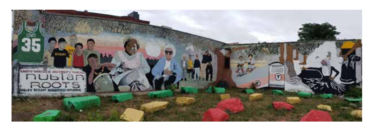
Fig. 6: "Nubian Roots" mural on Dudley St., Roxbury, MA.

Efforts to update the way we looked at our Nubian collection in preparation for the exhibition led to the realization that things Nubian were all around us in the popular imagination. A mural painted by local youth in 1993 on the side wall of Davey's Supermarket in Roxbury, a centre of the Boston African-American community and not far from the Museum, featured members of the local population of all ages and "Nubian Roots" writ large (fig. 6). We were reminded that "Nubian Notion", an Afro-centric convenience store, which had been a major presence in the same area for nearly 50 years (1968-2016) had only recently closed.