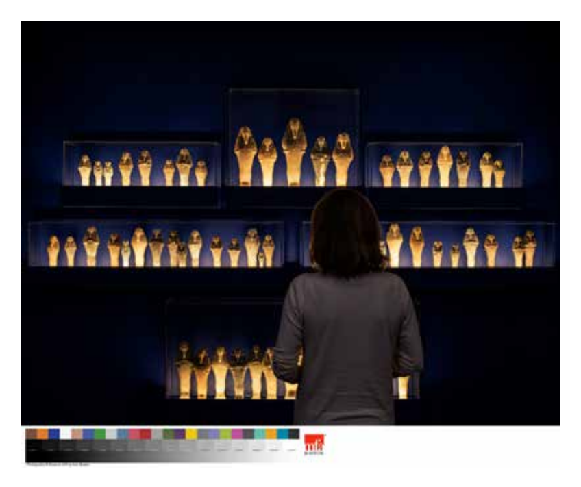
Fig. 5: Napatan Royal Shawabtis in Ancient Nubia Now exhibition at the Museum of Fine Arts, Boston. October 13, 2019 to January 20, 2020, Ann and Graham Gund Gallery.

York, thanks to the help of the Boston Nubian community. The Sudanese Ambassador to Canada came from Ottawa with two dozen colleagues. groups included Other Boston-area clergy and the Boston Public Health Division of Violence Prevention. Members of the National Committee for Antiquities and Museums Khartoum sent congratulatory notes.