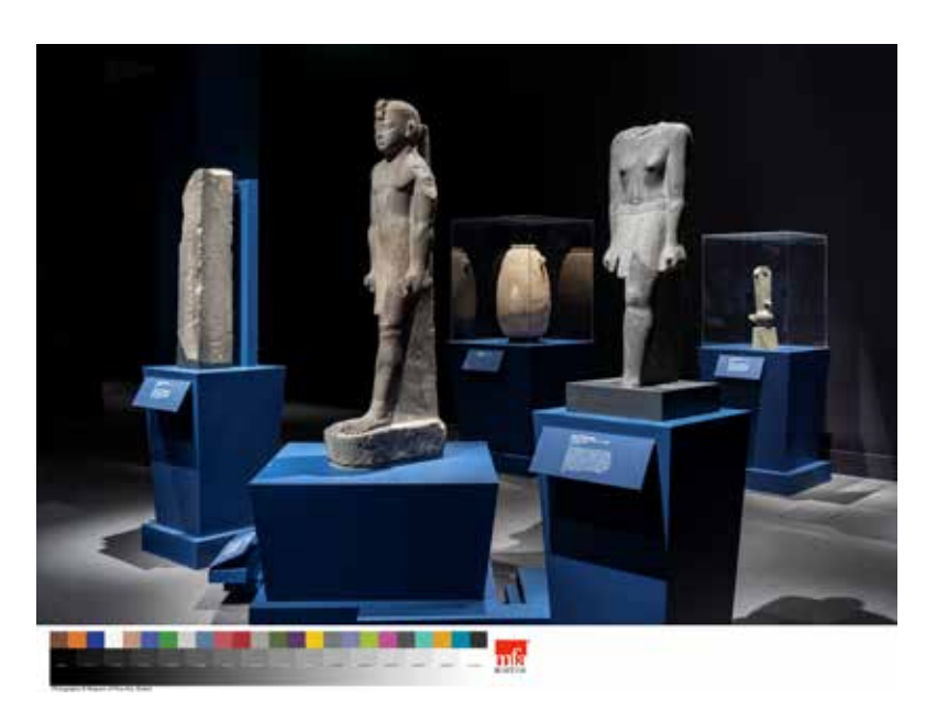
Fig. 4: Napata Gallery in Ancient Nubia Now exhibition at the Museum of Fine Arts, Boston. October 13, 2019 to January 20, 2020. Ann and Graham Gund Gallery.