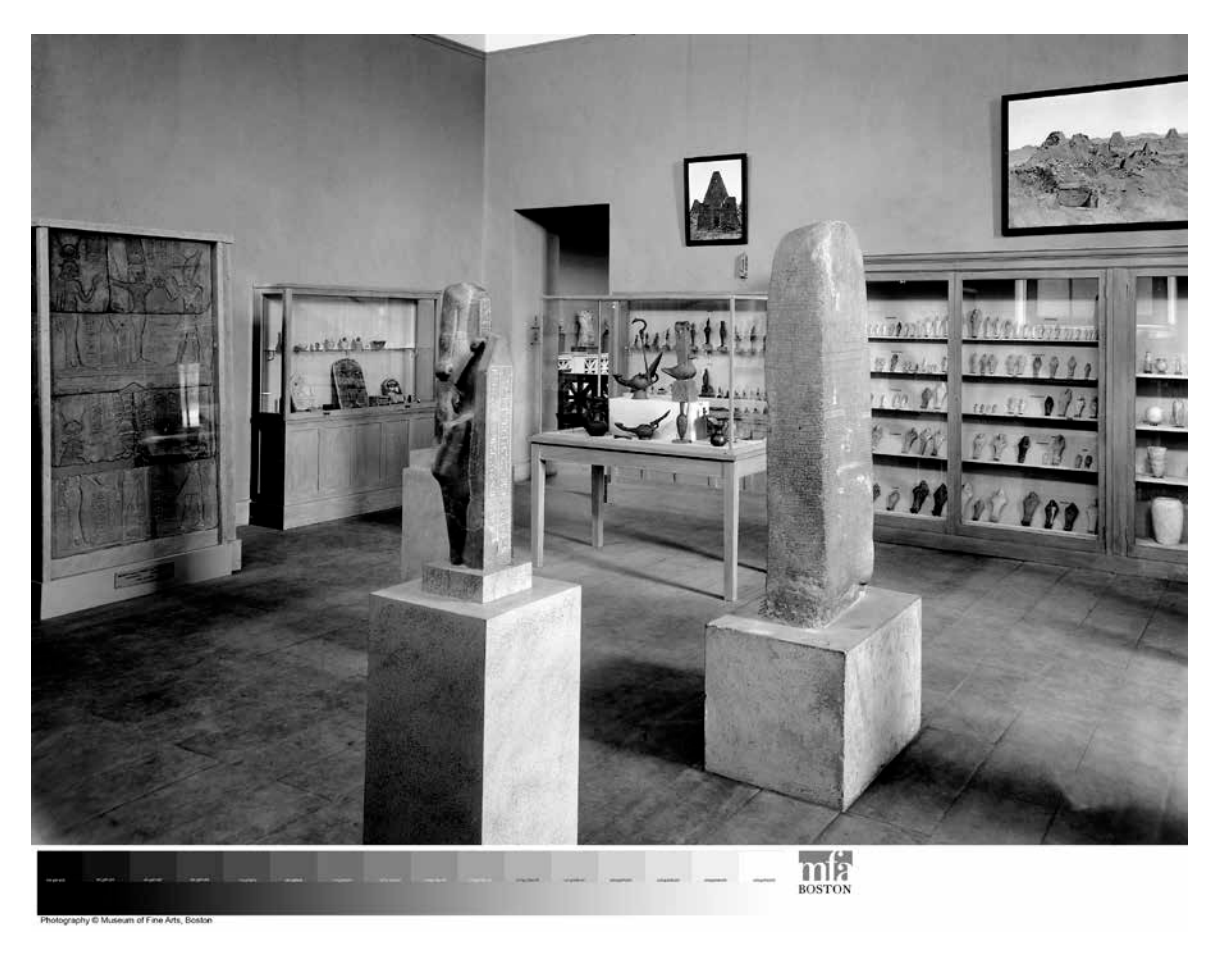
Fig. 1: Former Late Egyptian Gallery at the Museum of Fine Arts, Boston, 1931, featuring Egyptian and Nubian objects.