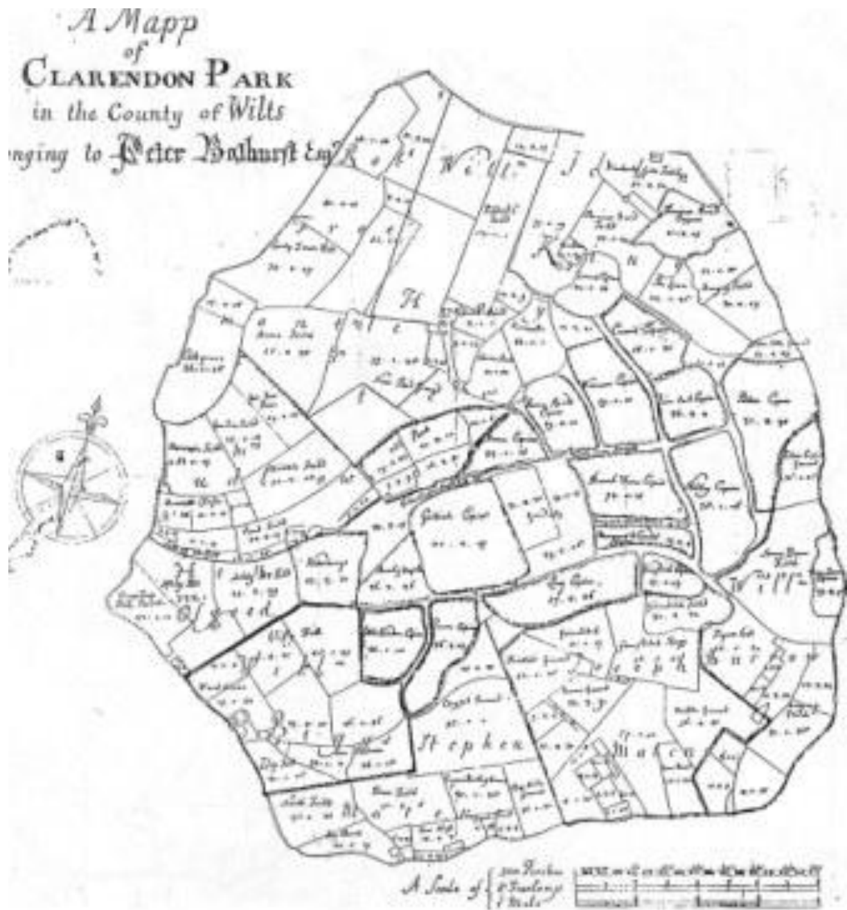
Figure 5: The estate map prepared for Peter Bathurst in 1713. Many of the deerpark features have disappeared. The outer pale is not illustrated as a pale. The 'Pady Course' has gone, a relict feature being 'Paddock C Feild' where part of the deer-course formerly ran north-eastwards to the north of Winchester Gate field. The grazing 'launds' have been turned over to arable farming. There is no major residence in the park at this date. The palace is a ruin, scarcely noticed by the surveyor, and the new mansion house was not begun for some years after 1713 towards the south-east corner of the estate. The 'Becket Cross' is marked near the north point of the park.