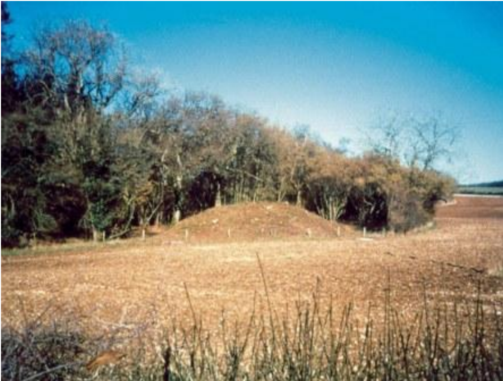
Figure 2: A great Bronze Age Barrow on the outer perimeter pale of the park near Pitton Gate (see Fig. 1, Fig. 3 etc for Pitton and the gate). The boundaries of the park incorporated many ancient features and it has been said that, although there is no Anglo-Saxon boundary charter for Clarendon, surviving landscape features would make it easy to write one. The barrow may have been heightened in the eighteenth century to make it a more impressive landscape feature (Photograph by Tom Beaumont James. Copyright).

A clear feature of the medieval park boundaries is the prehistoric siting of barrows round the northern perimeter where a succession of Neolithic long barrows is found. On and adjacent to the north-west and east perimeters of the park there are also a number of Bronze Age barrows of various dates, some of which, notably the great barrow at Pitton beside the Pitton gate, actually lie on the perimeter itself (Fig. 2, see also Fig. 1. Fig. 3 etc). It seems likely that all these great earthworks derive from early settlements located within the area of the later medieval park and that they are also likely to