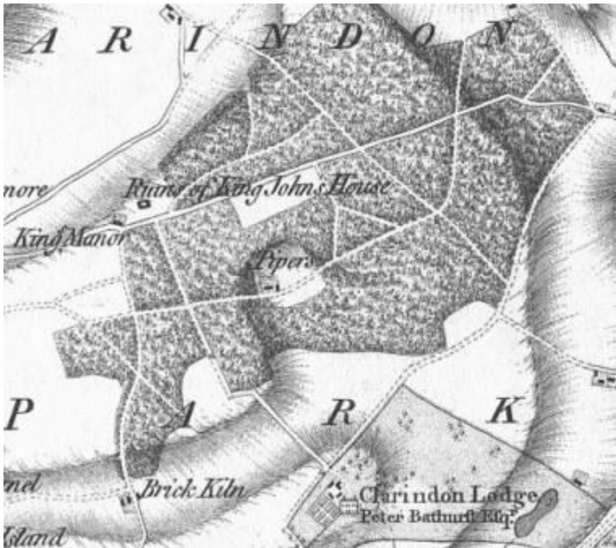
Figure 6: The Andrews and Dury map of 1773. By this time 'Clarindon Lodge' had been created in the south-east corner of the park. The woodland is no longer a series of separate coppices from which deer were excluded by banks and ditches as shown c 1650. However, the 'park' surrounding the Lodge does appear to be paled, the garden beds are enclosed, and water was available to deer at the lake. In the picture of the mansion in 1791, fewer than twenty years later three fallow deer are seen in the foreground, JAMES, GERRARD, Clarendon (as note 2) Frontispiece.