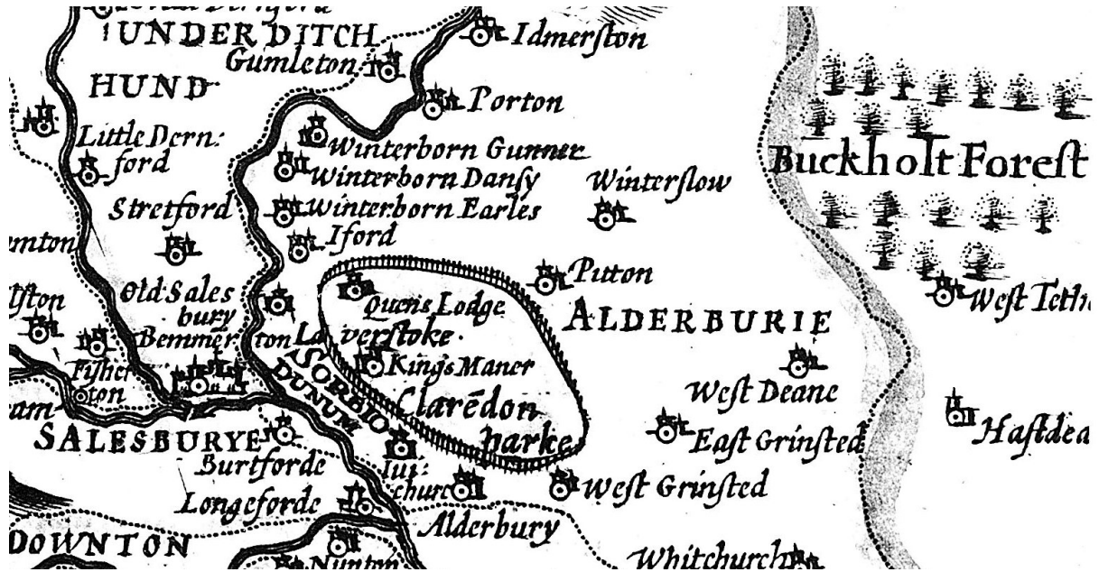
Figure 4: On the Norden/Speed map of c. 1610 Clarendon Park is shown with its outer pale and two buildings King's Manor and Que[e]n's Lodge. Although the palace was ruined by then, the park is clearly illustrated as an enclosure. Contemporary documentation shows James I (reigned 1603–1625) took a close interest in the park and kept in enclosed and supplied with deer throughout his reign. The local context in which it existed, of Old Sarum (Sorbiodunum), Salisbury, adjacent forest areas and settlements, is depicted in detail.