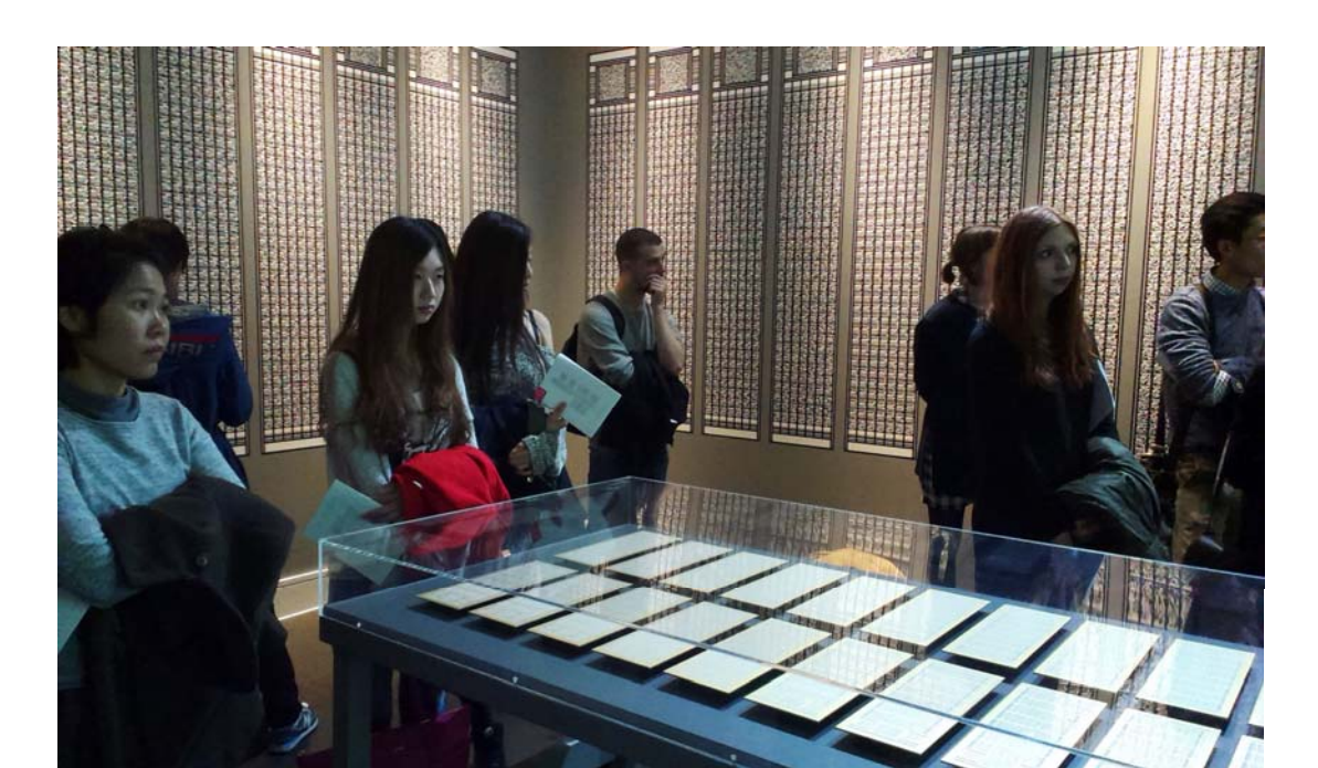
Figure 5: Students of Digital Arts and Culture at Michael Takeo Magruder's DelCoding the Apocalypse exhibition, Somerset House, King's College London.

Like 'New Media' and 'Digital Humanities', 'DAH' is a temporary name that has served its purpose. By continuing to emphasize the 'digital', rather than