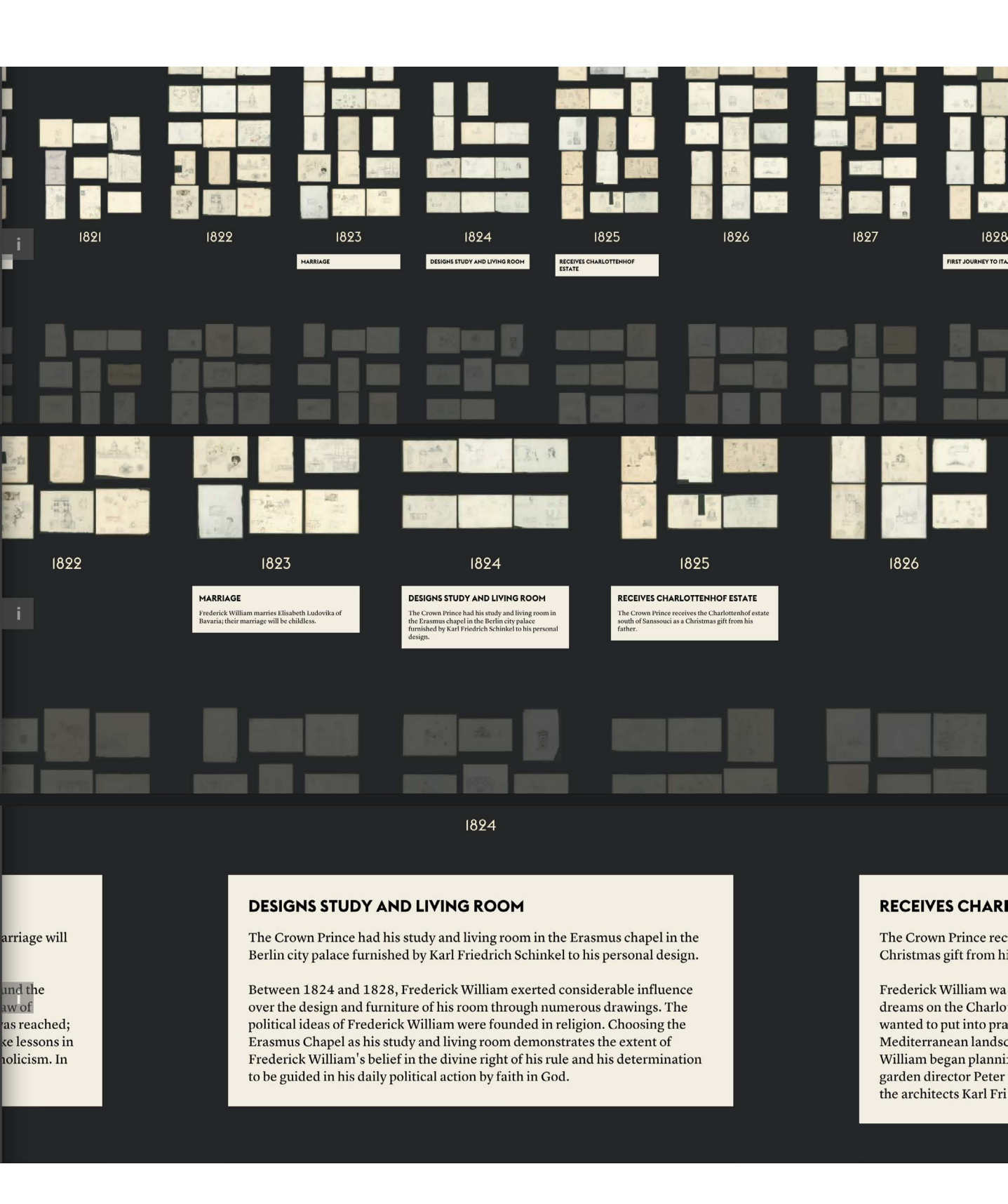
Figure 3: The timeline provides historical context at varying levels of detail.