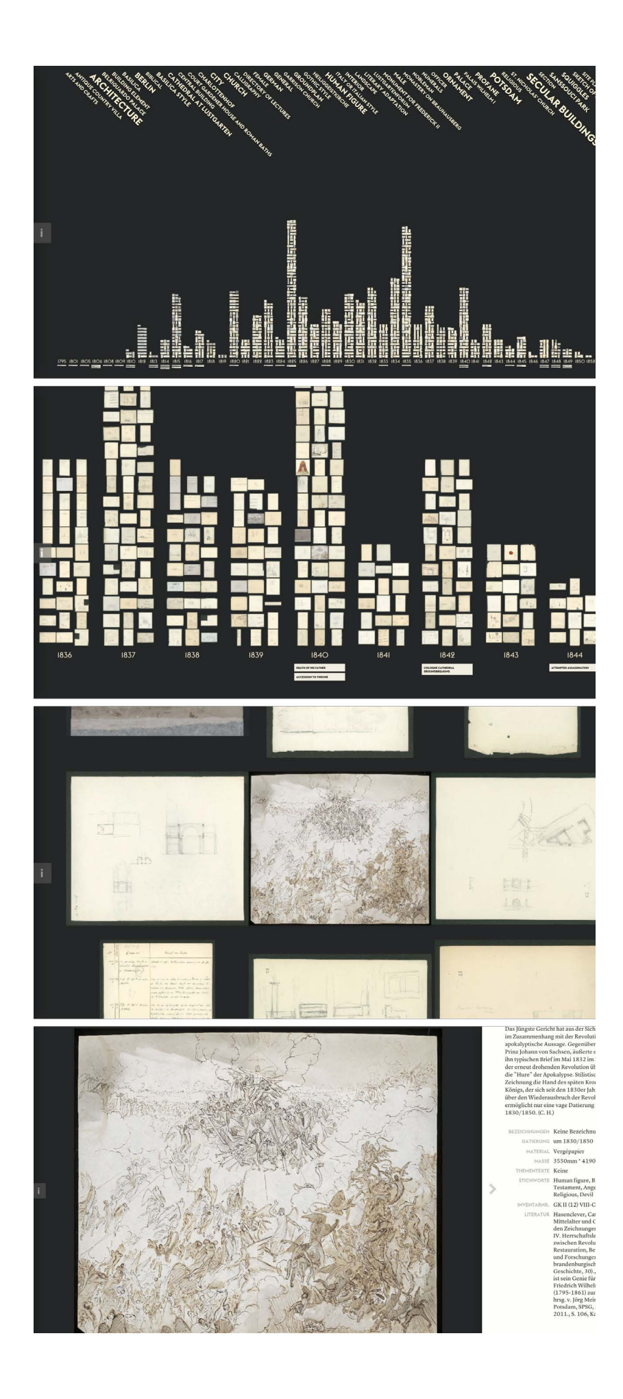
Figure 1: From top to bottom: Gradually zooming from an initial bird's-eye view of the visualization to a midpoint view showing several sketches in temporal proximity to close-up views of one individual drawing.