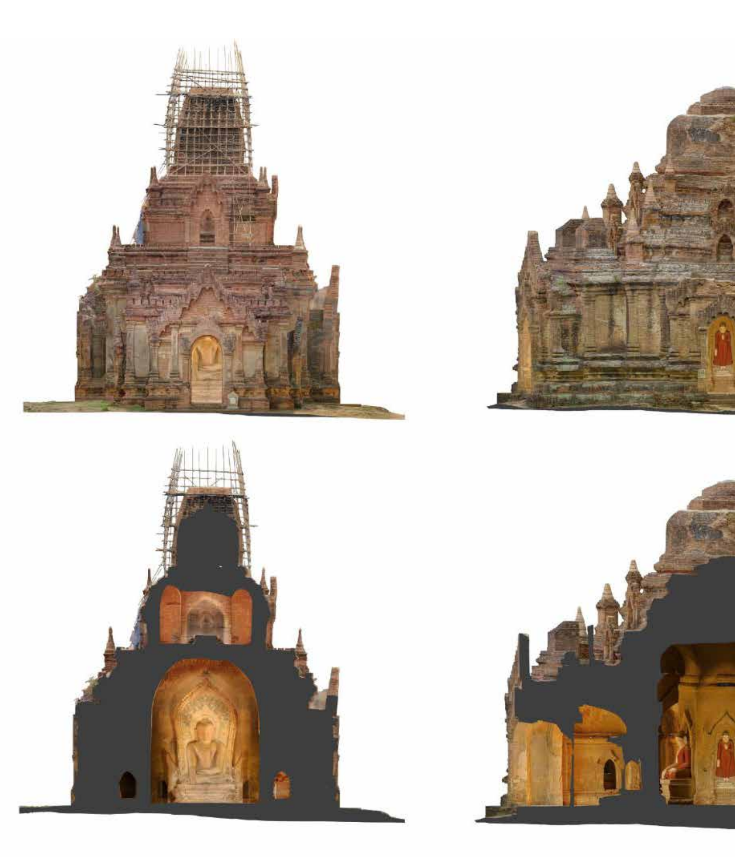
Figure 5: Exterior elevations (top) and clipped interior sections (bottom) of temples at Bagan. Center, (bottom and top): Eim Ya Kyaung temple. Left and Right (bottom and top): Khemingazedi temple.