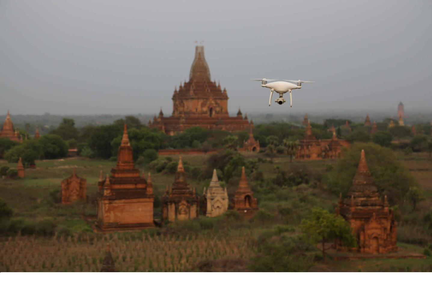
Figure 3: Drone at Bagan, Myanmar: aerial photographs captured by a remote-controlled drone provide images of surfaces, such as rooftops, that are inaccessible to the scanner; digital models of these features can be generated from the images and combined with laser scans using photogrammetry software.