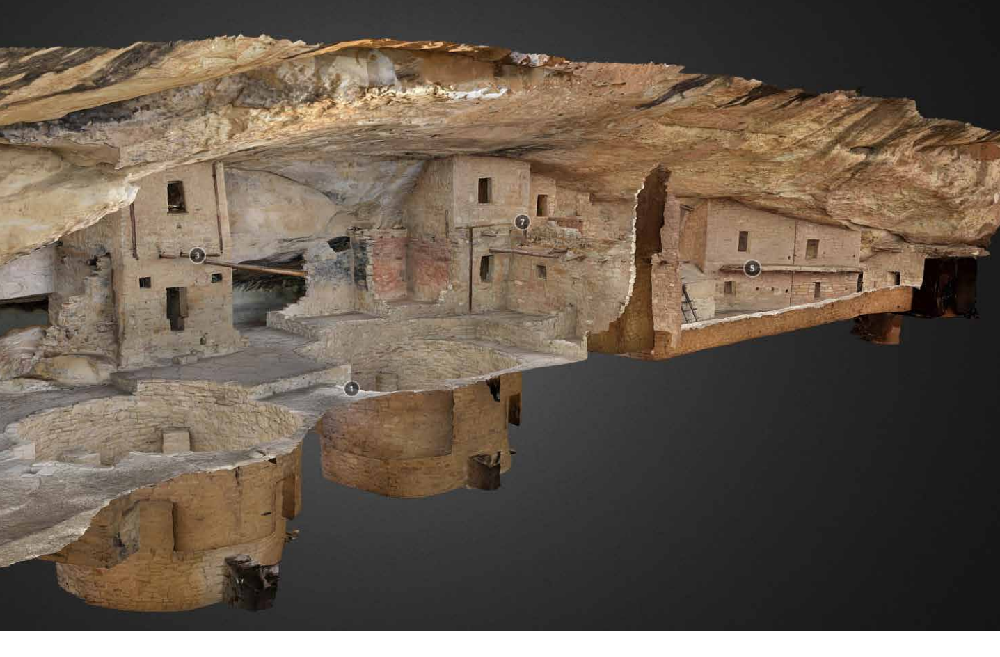
Figure 2: Digital rendering of Mesa Verde, made available in Sketchfab by CyArk.

We then have to figure out a scope that makes sense, given the funding, and given the challenges on site. Usually we end up on site for about one to two weeks. We mobilize the team. They go out there with a suite of equipment; we use a combination of 3D laser scanning (fig. 1), terrestrial photogrammetry, and aerial photogrammetry, through drones (fig. 3). On site we capture hundreds of scans. Tens of thousands of photos. And then, all that data comes back with the team.