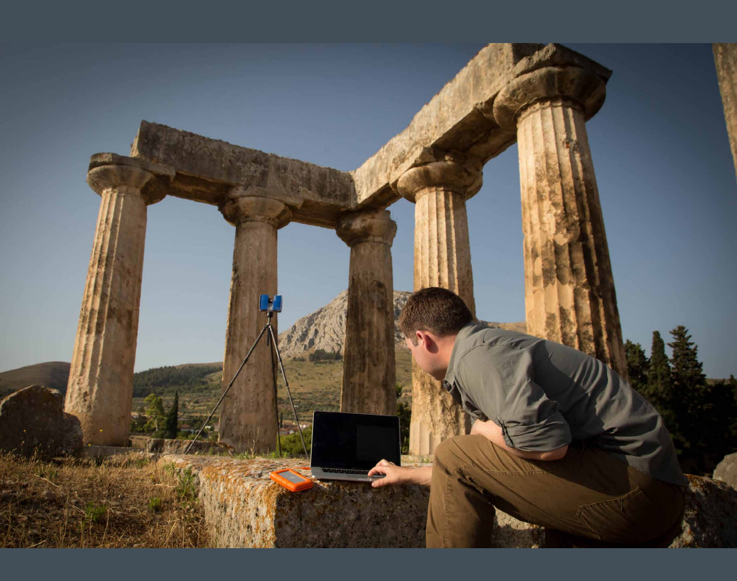
Figure 1: Scanning in the field, Temple of Apollo at Corinth: a laser scanner (blue, on tripod) detects surfaces that face it and registers these surfaces as a series of points in coordinate space. Data can subsequently be reviewed on a laptop in the field, and multiple scans can be pieced together (registered) to form a composite of the site.