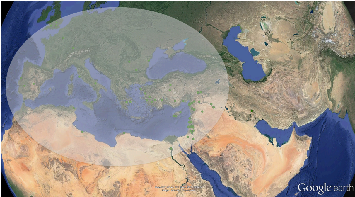
Illustration 3 c: The distribution of Antiochene coins during the late third century CE through late antique period (c. 235-423 CE).

During the Hellenistic period, bronze and silver coins minted at Antioch exclusively for the Seleucid kings spread from Asia Minor far into the eastern reaches of their empire. Based upon the relative quantities of the coin finds from each location, Antiochene coin finds were not evenly distributed within this span, but appeared in a higher concentration within Syria. This aligned with what is already known about the initial distribution of royal mints within Seleucid territory and the subsequent importance of Antioch as the Seleucid empire crumbled under other governmental powers. 47 Even though these ever-shrinking political boundaries greatly limited the movement of Antiochene coins out of Syria, small quantities of both silver and bronze nevertheless appeared in the Parthian empire and likely reflect commercial traffic still connecting the Mediterranean to further east. 48