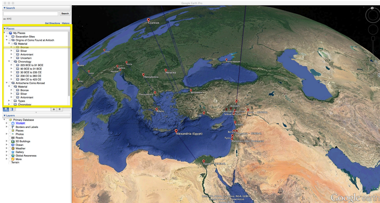
Illustration 2: A screenshot of the Google Earth Pro platform with the Places panel highlighted. Individual data points can be organized into folders in order to control what information is visualized.

Selecting any of these folders in the “Places” panel toggled the appearance of that data and created a straightforward method for easily comparing hoard data to site data or coins of different issuing authorities or metals. Placemarkers were also added for each excavation included in this study in order to account for locations that had been examined, but had no Antiochene coins. Rough maps of ancient trade routes and borders were displayed beneath the coins as a basic method of contextualizing whatever data was viewed.