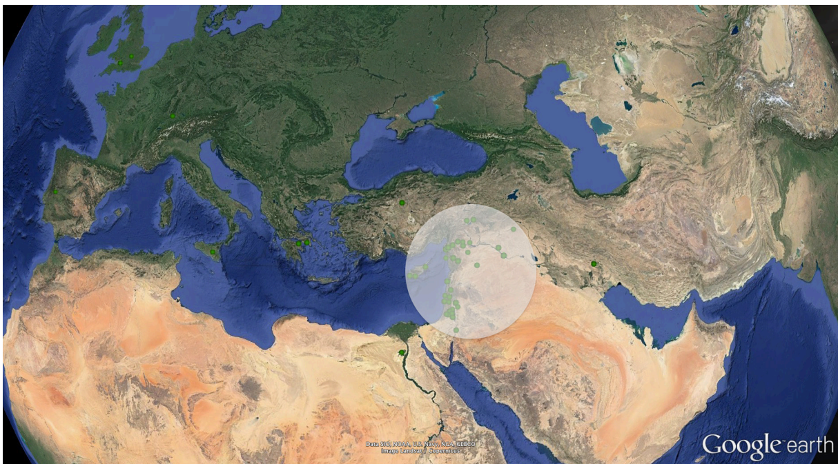
Illustration 3 b: The distribution of Antiochene coins during the Roman imperial period (c. 30-235 CE).