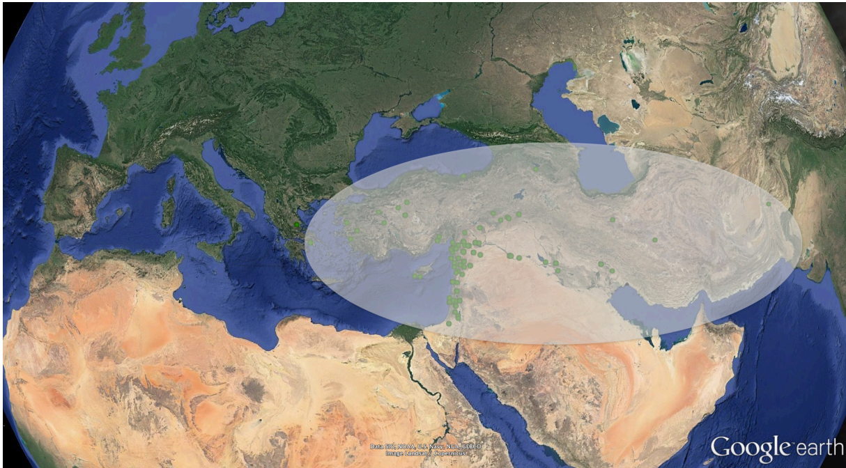
Illustration 3 a: The distribution of Antiochene coins during the Seleucid period (c. 223-91 BCE).