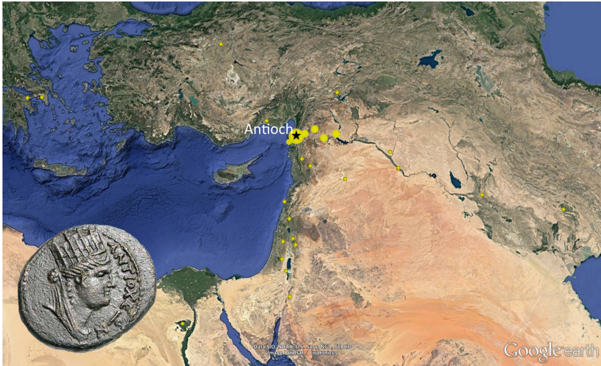
Illustration 7: The roughly weighted distribution of Antiochene civic coins as visualized in Google Earth Pro. The circles are weighted to relative quantities. Inset of Antiochene civic coin image used with permission of wildwinds.com (ex Pegasi Numismatics Auction 140, lot 218).

circulated around the city with a few stray finds moving further away with travelers (ill. 7). After all, the coins celebrate the internal values of Antioch's own citizens and were likely directed toward use by this audience within the confines of the city and the immediate territory. 75 Neighboring cities may have adopted the same practice and possibly refused to accept Antiochene coin as currency within their borders. 76