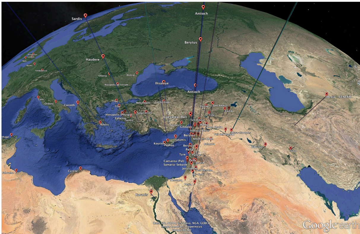
Illustration 1: A screenshot of geo-referenced quantities of coin finds in Google Earth Pro.

For the purposes of this study, Google Earth facilitated the creation and exploration of an interactive, thematic map charting quantities of coins with specific attributes over space and time (ill. 1). 19