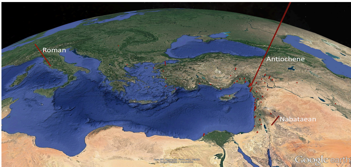
Illustration 4: A screenshot in Google Earth Pro of the distribution by origin of Roman era coins found through excavation at Antioch. The three highest quantities of coins are highlighted: those from Rome, those from Antioch, and those from the southern Levant.

Google Earth also helped illuminate finer patterns in the relationship between Antioch and the wider Mediterranean and East. For instance, this program opened up new possibilities for the diverse body of single finds of non-Antiochene coins from the excavations at Antioch. These coins have not attracted significant study, largely because the vast majority of coins from Antioch's own mint(s) overwhelms their numbers (ill. 4). 53 While the dominance of Antiochene coins testifies to the continued importance of the city's mint(s) in meeting its own currency demands, Google Earth provided the perfect platform for making sense of the disparate foreign coins that arrived in the city. 54 When these coins were mapped according to where they originated, several patterns materialized in their spatial and chronological distribution.