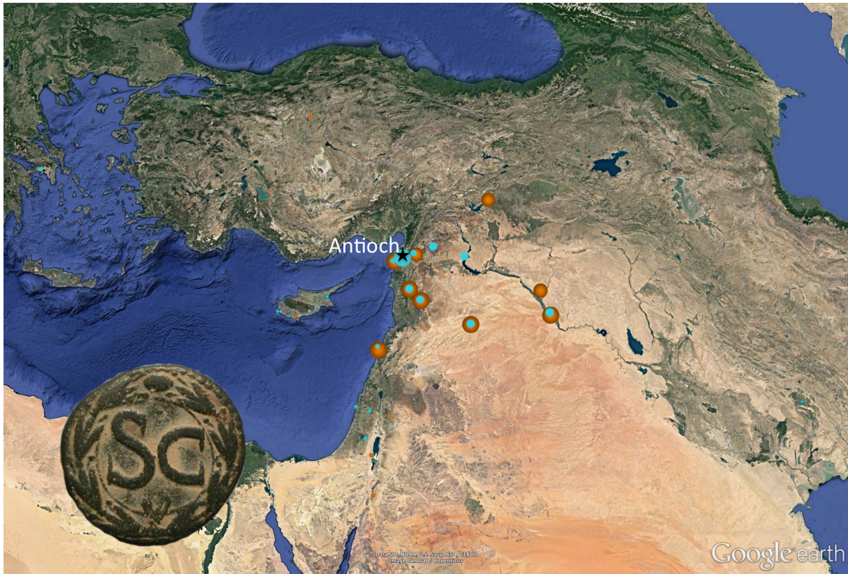
Illustration 6: The roughly weighted distribution pattern of provincial SC coins as visualized in Google Earth Pro. All orange circles represent coins dating to the first century CE. The teal circles represent provincial SC coins dating to the second and third century CE.

These coins were likely part of an attempt by the Roman government to standardize regional bronze coinage in the immediate years after annexation. 70 The military also affected the distribution of these coins as those with legionary countermarks appeared in small quantities beyond the limits of Syria to the east and further south. 71 Despite this use, however, the maps in Google Earth did not reinforce scholarly claims that this type acted as “the official Roman bronze coinage of the far eastern provinces of the Empire.” 72 Additionally, the distribution of provincial finds dating to the later second and third centuries CE suggested a lessening of importance in this type of coin even within the provincial confines of Syria. 73 It is possible that the increase of individual cities minting their own bronze coinage lessened the need or enforcement of the provincial coin’s circulation. Only at Antioch did the quantities of provincial SC coins appear to increase, which may point to the city’s role as a regional center of the Roman government rather than a completely independent city. 74