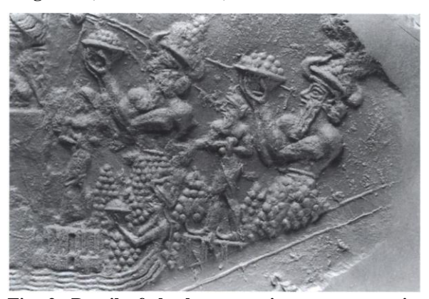
Fig. 2: Detail of the human prisoners, mountain deities and river goddess (Hansen 2002, 95).

anthropomorphic. The divinity of these male figures is shown by their horned crowns.<sup>38</sup> Their bearded heads wear horned crowns, like that of the king Naram-Sîn, a clear indication of their divinity. Moreover, the large chignons at the back of the head are a typical representation of gods and kings in the Akkadian period.<sup>39</sup> Each divine prisoner carries in their hands an offering vessel, which is filled with objects defined as a series of drill holes similar to those used to represent the mountains.<sup>40</sup>