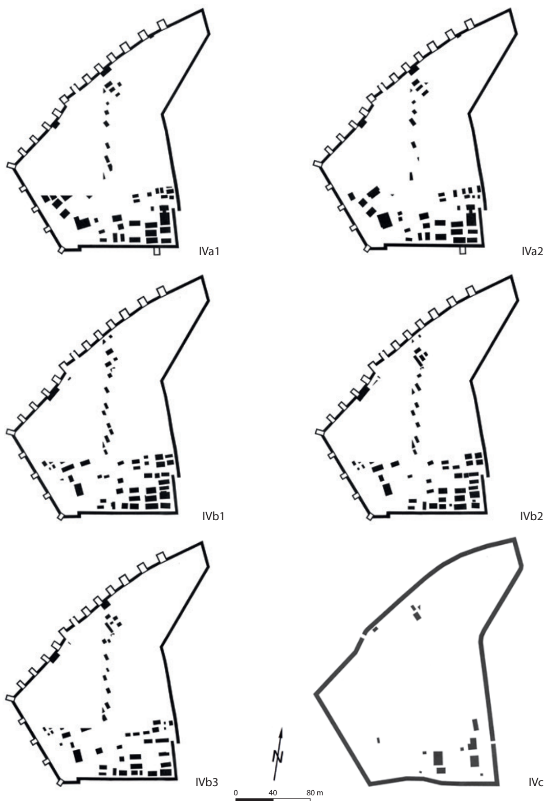
Fig. 3. The Heuneburg plateau and the housing in the phases IVa1–IVc (after VAN DEN BOOM 1995, 197 fig. 3; 201 fig. 4; 205 fig. 5; 209 fig. 6; 215 fig. 7; 219 fig. 8).