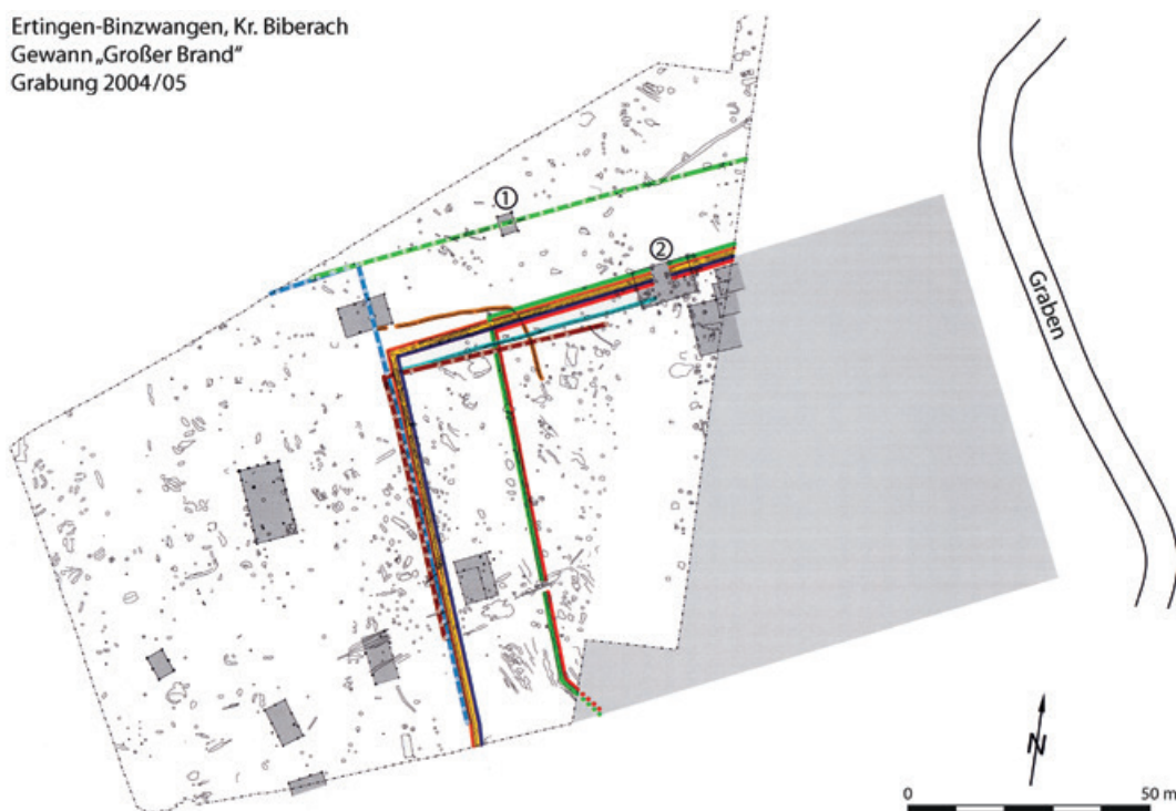
Fig. 2. Excavation plan of a part of the outer settlement at Ertingen-Binzwangen, “Großer Brand” (after KURZ 2010, 166 fig. 2).