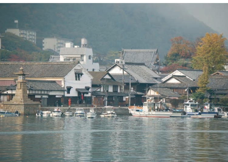
Views of Tomo-no-Ura

On 6 th August 1945, the atomic bomb was dropped on Hiroshima. Located very close to the bomb's hypocenter, the former Hiroshima Prefectural Industrial Exhibition Hall (Genbaku Dome) was hit directly and by this became the only built structure in the world to give direct evidence of the disaster which happened then. To avoid such an atomic tragedy to happen ever again and for Hiroshima city to keep telling this story for ever, it was decided on 20 th June 1946 that this northern part of former Nakashima area should be conserved as a Peace Memorial Park: this Park was thus completed on 1 st April 1954. In 1996, the Genbaku Dome was inscribed on the World Heritage List on the basis of cultural criterion (vi), as "the only structure left standing in the area where the first atomic bomb exploded (... It) has been preserved in the same state as immediately after the bombing. Not only is it a stark and powerful symbol of the most destructive force ever created by humankind; it also expresses the hope for world peace and the ultimate elimination of all nuclear weapons."