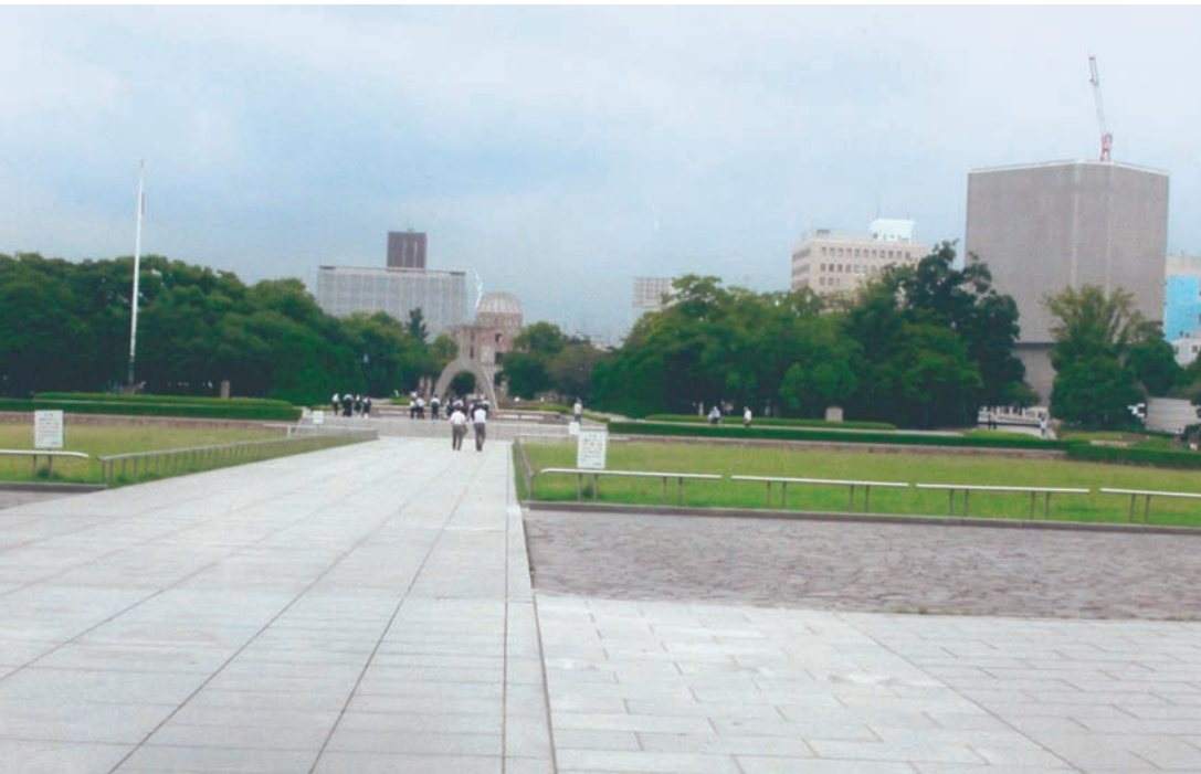
Hiroshima, view of the Genbaku Dome and the new apartment building

throughout the world. Any responsible institution is therefore requested to take measures that enhance the values of cultural heritage, and if the construction of an unsuitable building is planned, even though it may not be unlawful, it is of great importance that efforts are made to avoid such a construction. The recent example of the Cathedral of Cologne (inscribed on the World Heritage List in 1996) is to be mentioned, as having been inscribed on the List of World Heritage in Danger at the World Heritage Assembly of 2004, for the reason that "the construction of a group of high-rise buildings nearby the Cathedral as a part of town development plans damages the unity of space as World Heritage". It is our wish that through your good direction to the