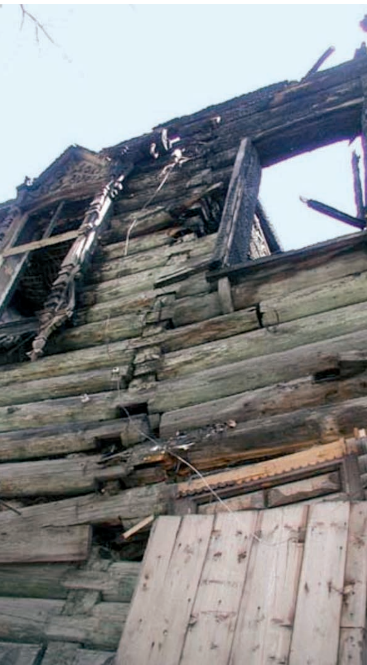
Semi-destroyed historic wooden house in Tomsk, Siberia

ing the river from one bank to another in the manner of a rope-walker (symbolising the transition to the other world). The external architraves, elements of the porch, the doors and other decorative details were painted red because that colour also has a protective function.