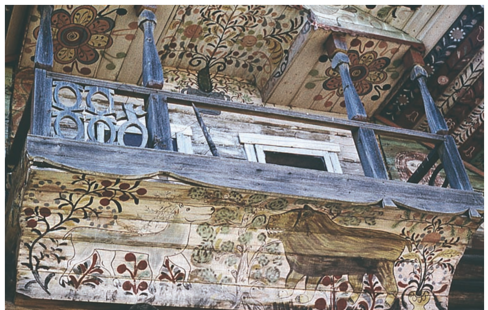
Paintings on the balcony and gable of the house of Bechin in North Dvina; painter: Timofei Makarov

Peasant artists also decorated distaffs, birch bark articles, shaft-