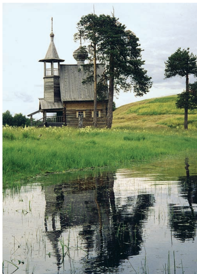
View of the chapel in the village of Glazovo in the Russian North (Kenozero)

From the artistic point of view, those paintings represent an independent and well elaborated part of folk art. One can discover