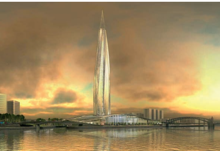
Planned Gazprom skyscraper in St Petersburg

ner on 1 December 2006. By 2016 the complex of buildings (office centre “Gazprom City”) is meant to be complete.