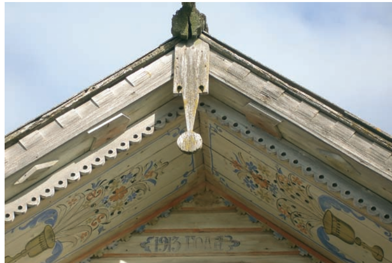
Painted gable on a dwelling house in Kargopolye and Poonezhye

In northwest Russia a certain manner of folk painting emerged in the 18 th century. Technically, it was based on a free brush touch and the application of white contour lines. Free and easy style of painting, bright colouring combined with technical virtuosity are