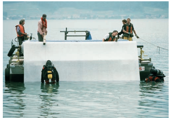
Erosion protection measures at Lake Biene, Switzerland (2003-2004). 'ROBOR' catamaran in action with geotextile mats. 6,000 m 2 of the settlement site in the bay of Sutz-Lattrigen have been covered over and 30,000 m 2 have been excavated archaeologically.

Artefacts made of organic materials survived thousands of years in the wetland settlements throughout the foothills of the Alps in exceptional states of preservation. Textiles, wooden vessels, a comb and a knife dating from the Late Stone Age found at the lakeside settlements of Vinelz and Lattrigen on Lake Biene.