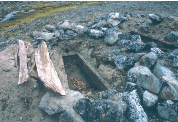
Ytre Norskøya, excavated 17 th century whaler's grave

North America (see Olynyk and Chapple in this volume) describe. During the ice-free summer season, wave action can erode coastal zones up to several metres a year, while the water-land interface during this period warms the newly exposed permafrost surfaces, thus accelerating the erosion process (see the Arctic Coastal Dynamics project, eg. report 2004 at http://www.awi-potsdam.de/acd/ws5-Dateien/5th_ACD_Report_w_links.pdf ). With the above-mentioned summer and whole-year ice melting in the Arctic Basin, the coastal erosion will increase.