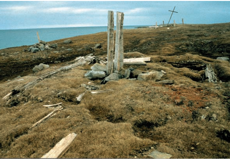
San Sebastian, Bjørnøya, erosion of the remains of a mixed site