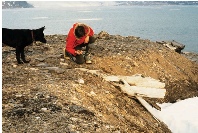
Ebeltoftthamna, erosion of a 17th century graveyard into the sea