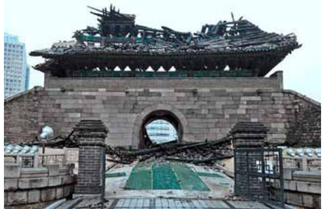
The gate immediately after the fire