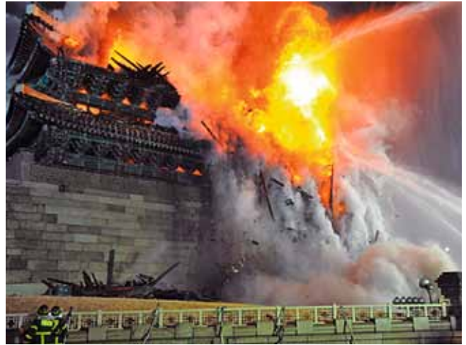
The fire of 10 February 2008