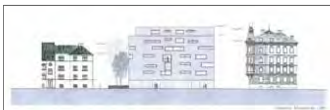
Building project Ernest-Thun-Strasse 2/Schwarzstrasse 45, visualisation of situation in Schwarzstrasse

structure is meant to be an architectural “signal” for the square in front of the station. The ICOMOS advisory mission pointed out that the “skyline” of the city of Salzburg does not need any high-rise buildings, as it is already characterised in an exceptional way by the near and distant mountains, the steeples and domes of the churches as well as by the fortification Festung Hohe Salzburg on Mönchsberg. Under these circumstances a development with additional high-rise structures in the historic urban landscape of Salzburg and in the wider surroundings is hardly imaginable. A certain building height in the area of the station already exists with the Hotel Europa and the neighbouring buildings from the 1950s. Nonetheless, it does not seem compulsive that the planned new high-rise in Rainerstrasse must necessarily have the same height as the Hotel Europa, as suggested by the Architectural Advisory Board (Gestaltungsbeirat). The ICOMOS advisory mission therefore recommended that in accordance with the already approved development plan the height be reduced in relation to the 59-metre-Hotel Europa.