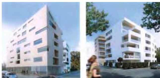
Visualisation north-east corner Schwarzstrasse (left), north-west corner Elisabethkai (right)