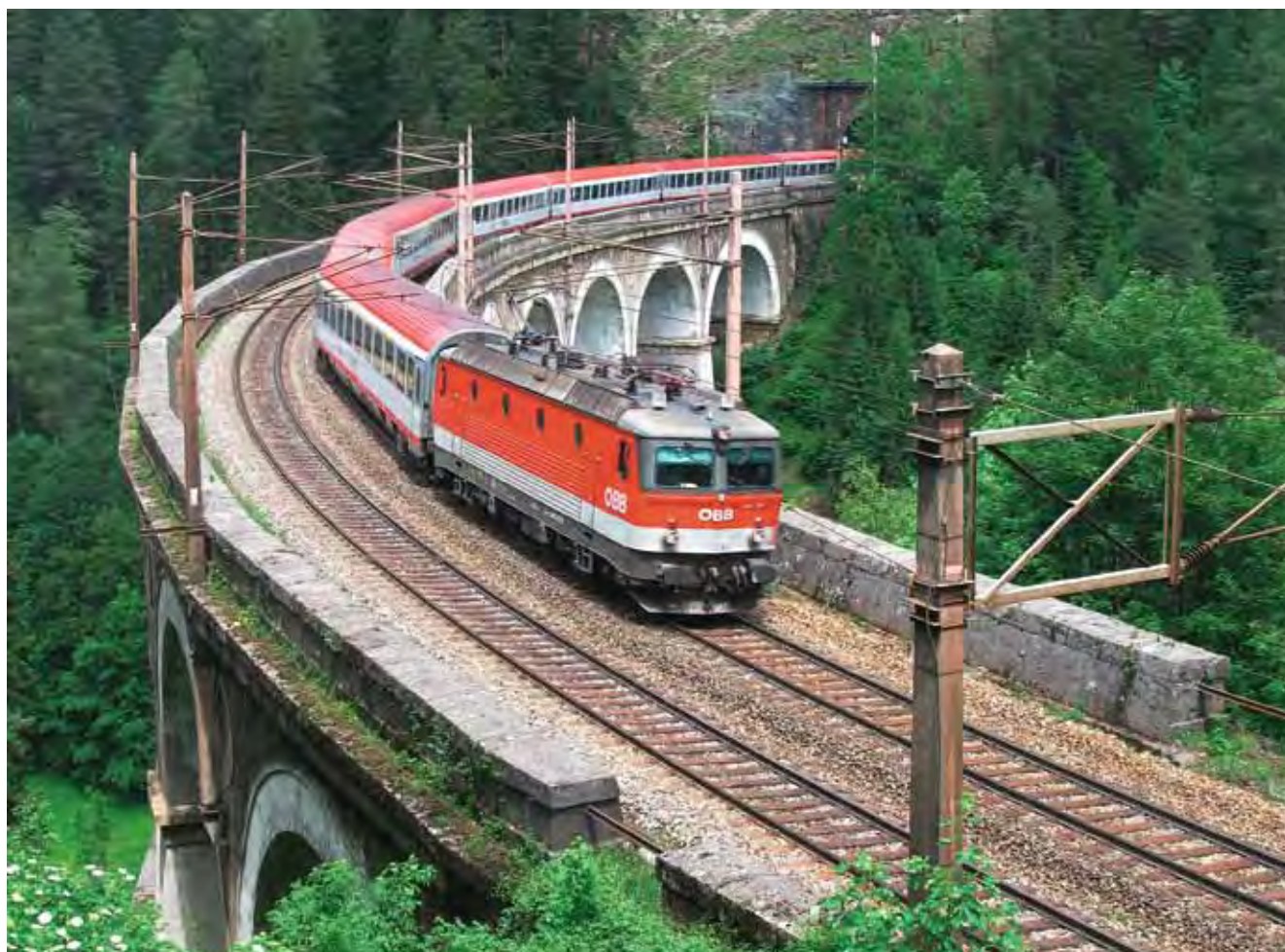
Semmering Railway viaduct Kalte Rinne