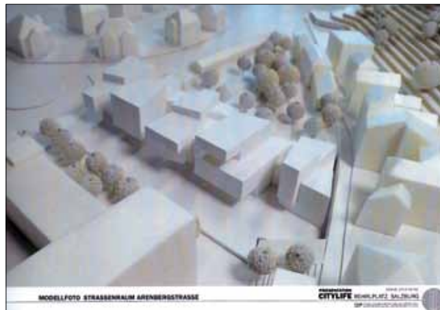
Rehrlplatz, model of the planned complex of buildings (status: April 2013)

Another example of aggressive urban development in the historic centre of Salzburg is the project Priesterhausgarten in Paris-Lodron-Strasse . The Priesterhausgarten lies in the core zone of the World Heritage area and in protection zone I. The grounds behind the late medieval town wall in Paris-Lodron-Strasse became the property of the Priesterhaus in 1848. Today the grounds are used as access to the underground garage and to the neighbouring houses as well as a car park. The regrettable condition of this area bordered by the town wall and the wall of the Loreto monastery hardly shows that these are remains of a once important garden complex extending to the later Dreifaltigkeitsgasse. This early baroque garden laid out in 1630 was part of the primogeniture palace erected by Archbishop Paris Lodron: A view of the town (Philipp Harpff 1643) shows these gardens in the centre of the “Lodronstadt” erected by the Archbishop, including a precursor of the later Mirabellgarten – all in all a very important site for the World Heritage Salzburg, the historic view also showing a pavilion in the central axis which after a great