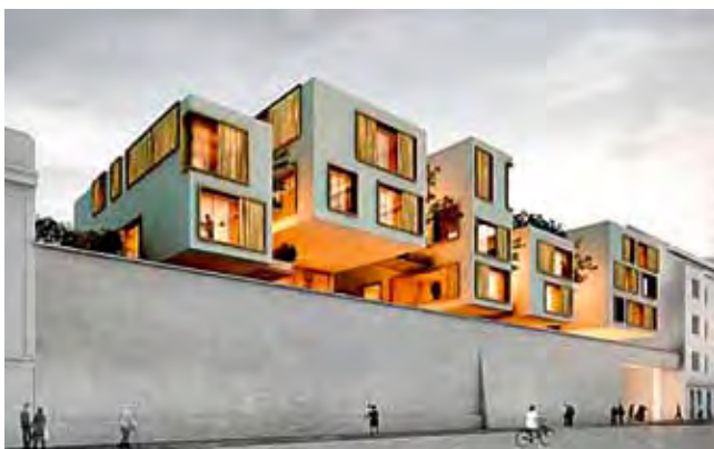
Priesterhausgarten, visualisation of building project

circular flower bed ends in front of the still existing grotto at the wall of the Loreto monastery. This grotto with its already exposed water basin of Untersberger marble would have to be carefully restored. Besides, the traces apparently located one metre below ground would have to be further investigated in an archaeological excavation, i.e. before new constructions of whatever kind could be planned. Sadly, this historic open space so important for the World Heritage of Salzburg is no longer a green area. Instead, it has been declared building land. The result of an architectural competition of 2012, presented to the ICOMOS advisory mission, envisages a compact mixture of apartments, cinemas, garages, and public lavatories. The three-to-four-storey rows of houses separated by strips of lawn would be visible high above the town wall in Paris-Lodron-Strasse. The grotto would be eclipsed by the new constructions that negate the historic qualities of the place. The advisory mission recommended in 2013 to reconsider and reverse the classification as building land. In the case of a considerably reduced development, fitting in harmoniously according to the regulations of the Law for the Preservation of the Old Town Centre (Altstadterhaltungsgesetz), the visual integrity of the grotto and the central axis in the historic garden leading towards the grotto would have to be taken into account.