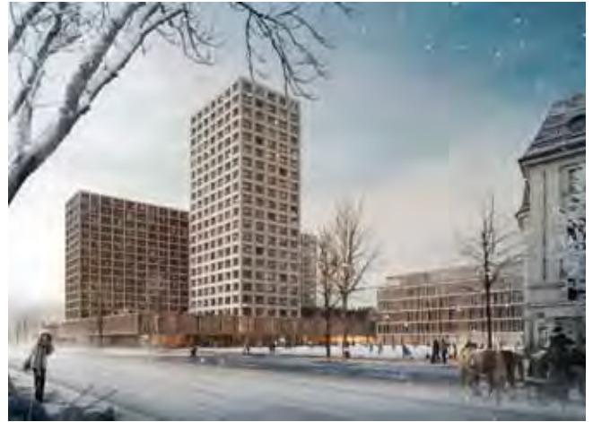
Winning design for the “new” Hotel InterContinental

There is not much hope that the City of Vienna will learn from the negative experiences with the Wien-Mitte project (see H@R 2002/2003, p. 42 f.) and the high-rise projects behind Belvedere Palace and near Schönbrunn (see H@R 2008–2010). Compared with the famous Canaletto view of Vienna the visual integrity of the historic centre with the tower of the Stephansdom seen from the Upper Belvedere could now be ruined by another high-rise project. The development project “Vienna Ice-Skating Club – Hotel InterContinental – Konzerthaus” lies in the World Heritage zone in the area of the Vienna Ice-Skating Club between Hotel InterContinental (opened in 1964) and the Konzerthaus (opened in 1913, a building by architects Fellner and Helmer). With regard to this project the World Heritage Committee at its 37th session in Phnom Penh in 2013 urged the State Party “to halt any redevelopment higher than existing structures until an evaluation has been made by the Advisory Bodies”. However, although in the international competition there were proposals that would have respected the visual integrity of the World Heritage, the first prize-winning design by the Brazilian architect Isay Weinfeld presented on February 27, 2014, a 73 metre-tall building, is another provocation by the high-rise lobby. This design would seriously harm the nearer surroundings and the entire silhouette