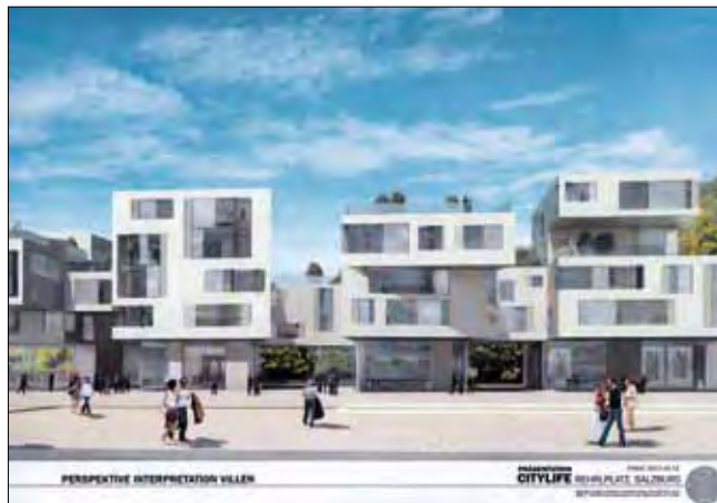
Rehrlplatz, design for new buildings (status: April 2013)

structure is meant to be an architectural “signal” for the square in front of the station. The ICOMOS advisory mission pointed out that the “skyline” of the city of Salzburg does not need any high-rise buildings, as it is already characterised in an exceptional way by the near and distant mountains, the steeples and domes of the churches as well as by the fortification Festung Hohe Salzburg on Mönchsberg. Under these circumstances a development with additional high-rise structures in the historic urban landscape of Salzburg and in the wider surroundings is hardly imaginable. A certain building height in the area of the station already exists with the Hotel Europa and the neighbouring buildings from the 1950s. Nonetheless, it does not seem compulsive that the planned new high-rise in Rainerstrasse must necessarily have the same height as the Hotel Europa, as suggested by the Architectural Advisory Board (Gestaltungsbeirat). The ICOMOS advisory mission therefore recommended that in accordance with the already approved development plan the height be reduced in relation to the 59-metre-Hotel Europa.