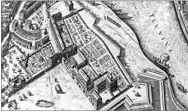
Ph. Harpff, map of Salzburg, 1643, detail showing the Priesterhausgarten. The arrow indicates the position of the grotto.