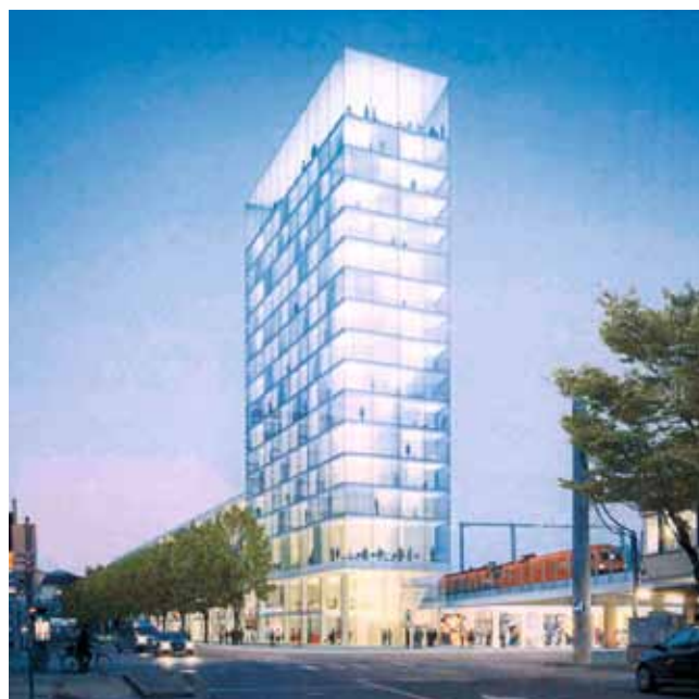
High-rise project Nelböck Viaduct Rainerstrasse/Bahnhofsvorplatz, visualisation

Another example of aggressive urban development in the historic centre of Salzburg is the project Priesterhausgarten in Paris-Lodron-Strasse . The Priesterhausgarten lies in the core zone of the World Heritage area and in protection zone I. The grounds behind the late medieval town wall in Paris-Lodron-Strasse became the property of the Priesterhaus in 1848. Today the grounds are used as access to the underground garage and to the neighbouring houses as well as a car park. The regrettable condition of this area bordered by the town wall and the wall of the Loreto monastery hardly shows that these are remains of a once important garden complex extending to the later Dreifaltigkeitsgasse. This early baroque garden laid out in 1630 was part of the primogeniture palace erected by Archbishop Paris Lodron: A view of the town (Philipp Harpff 1643) shows these gardens in the centre of the “Lodronstadt” erected by the Archbishop, including a precursor of the later Mirabellgarten – all in all a very important site for the World Heritage Salzburg, the historic view also showing a pavilion in the central axis which after a great