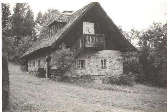
Sierling, little farmhouse (1744) in Styria

extremely different Hauslandschaften , ((farm)house-landscapes), extending from the Bodensee (Lake Constance) to the Neusiedlersee, with their particular patterns, buildings and farmsteads. In many regions, the leading industry – tourism – has additionally contributed to massive amounts of new construction and a homogenising of traditional methods of building. In all, the clichéd expectations of current living requirements have led to an extensive alienation and destruction not only of peasant architecture but also of villages, landscapes and townscapes of which it is an integral component. An illustrative example from western Styria, is the modest residential part of a Baroque cluster-farmstead complex built in 1744, in which the problems of preserving simple rural architecture are clearly recognisable.