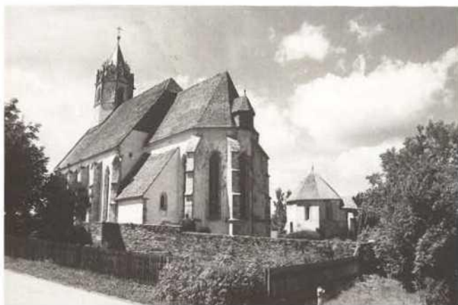
Maria Waitschach, late Gothic pilgrimage church