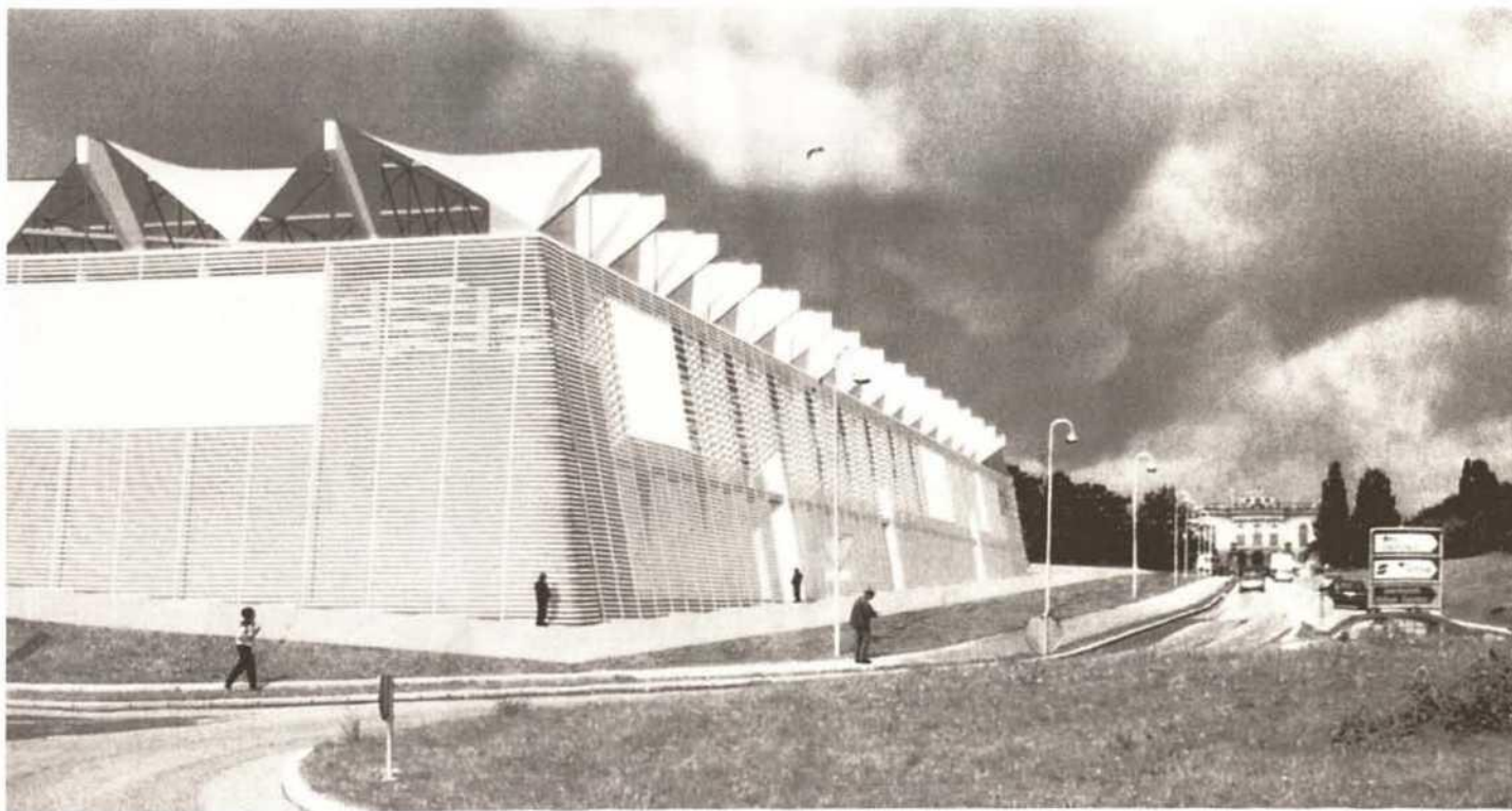
Project for a football stadium in front of Schloss Klessheim (in the background to the right)

Schloss Klessheim, built around 1700 for the archbishops of Salzburg, is a chief work of the famous architect Johann Bernhard Fischer von Erlach and one of the most important Baroque palaces in Austria. However, it is seriously threatened by plans for a football stadium. This stadium and a corresponding number of car parks would be built on the only remaining undeveloped ground near the palace and obstruct the view from the main axis of the park towards the steeple of the Müllner Church and the castle of Salzburg. It is of particular importance not to spoil this area, which is a nature reserve, since the surroundings of the palace and park have already been harmed by factories and motorways. If this plan is implemented, the palace will be degraded to an adjunct of a gigantic sports centre, for which many more suitable locations could be found. Public protest, also by ICOMOS, against the intended damage to Schloss Klessheim have not yet led to any change of mind by the relevant local politicians.