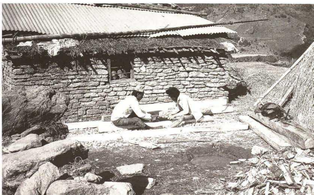
The traditions of vernacular architecture will hopefully be preserved in Nepal (Helambo mountains)