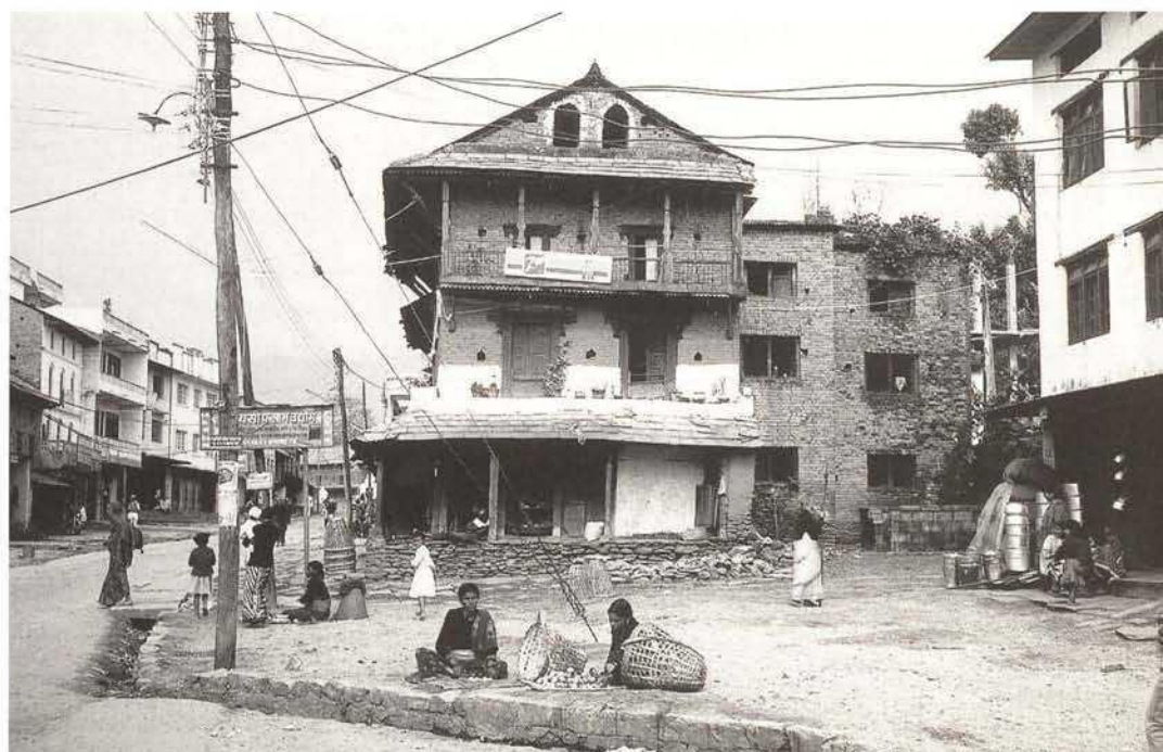
The historical dwelling buildings in decay are more and more replaced by the customary new constructions