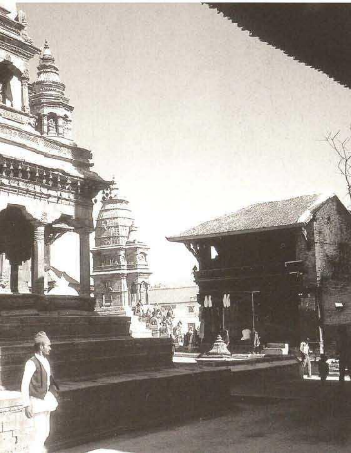
Patan, Durbar Square

(Information taken from: UNESCO heute No 1/2000; World Monuments Watch, 2000 List)