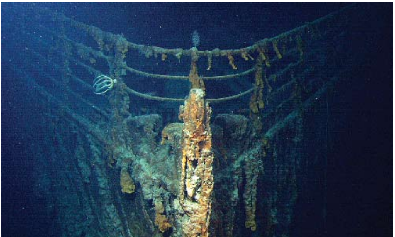
Figure 1: A close-up of the Titanic's bow (National Oceanic and Atmospheric Administration, Institute for Exploration and University of Rhode Island)

The wreckage of Titanic was discovered on September 1, 1985, during a joint French/U.S. expedition lead by Jean-Luis Michel of the French Ocean Institute (IFREMIR) and Dr. Robert Ballard. It was found approximately 340 nautical miles (nm) off the coast of Newfoundland, Canada two miles beneath the high seas (depth of 12 500 feet or 3,800 meters). The expedition discovered that the stern section was some 1,970 feet (600m) from the bow section and did not sink to the bottom intact as was previously believed. Shortly after the discovery, Dr. Ballard appeared before the US Congress seeking to protect the wreck. Congress responded through the enactment of legislation directing the Department of State to negotiate an international agreement to designate the wreck as a maritime memorial. A U.S. company working with IFREMIR returned to the wreck in 1987 and began to salvage artifacts from the debris field.