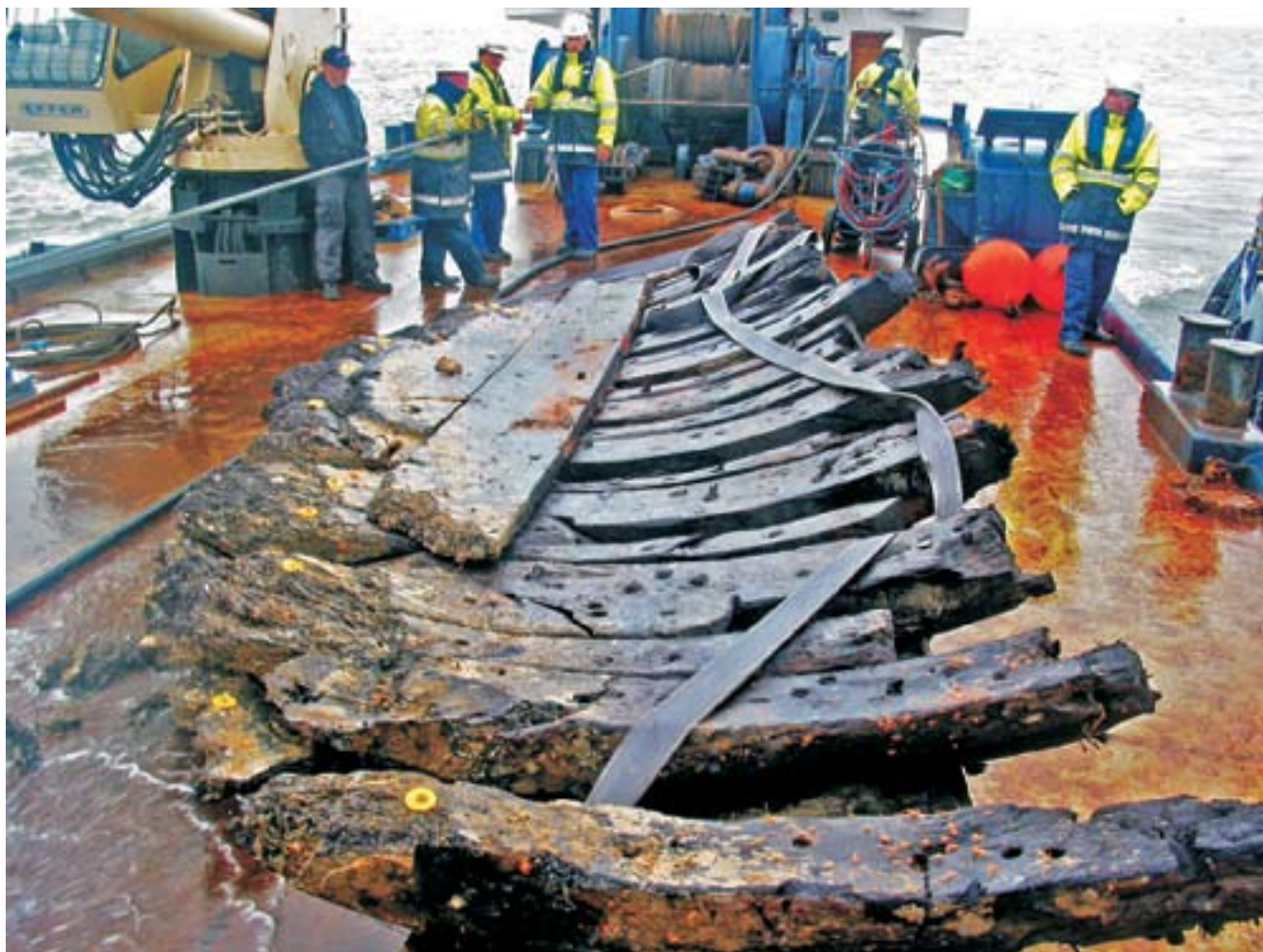
Figure 2: A section of the lower port side of the hull of the Princes Channel wreck, onboard a PLA salvage barge