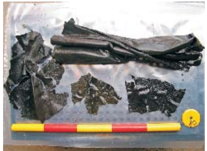
Figure 1: Part of a leather garment or jerkin excavated from the Princes Channel wreck

The PLA believed that the wreck had been completely recovered or dispersed, but a bathymetric survey to monitor the results of the channel dredging in October 2003 identified some 'high spots' in the vicinity of the wreck. A further diving