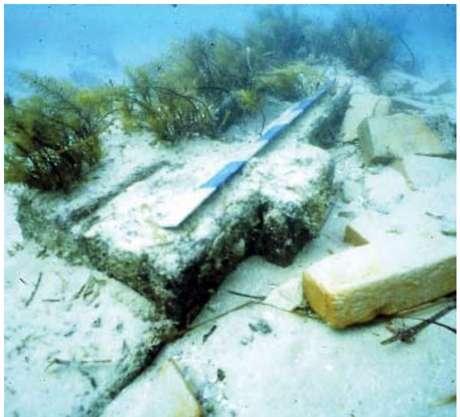
Figure 3: The Solway in the 1980s (B. Jeffery)

Cosmos Coroneos, 1997, “Shipwrecks of Encounter Bay and Backstairs Passage.” South Australian Maritime Heritage Series No. 3. Department of Environment and Natural Resources, Adelaide, South Australia; Australian Institute for Maritime Archaeology Special Publication No. 8.