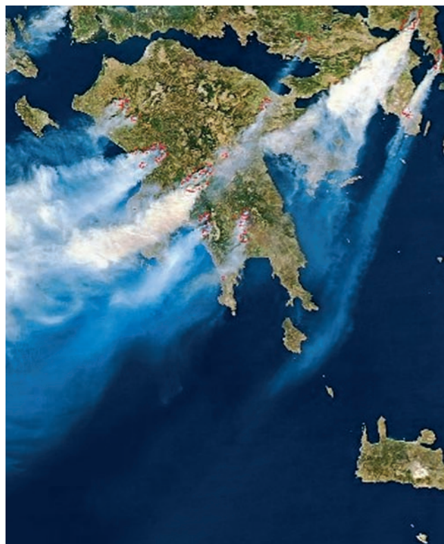
Satellite photo of the fires in Greece