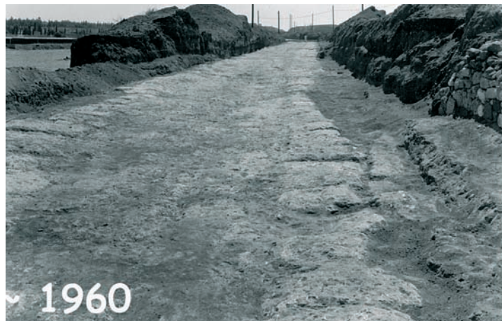
The Diolkos around 1960, and the same part in 2006.