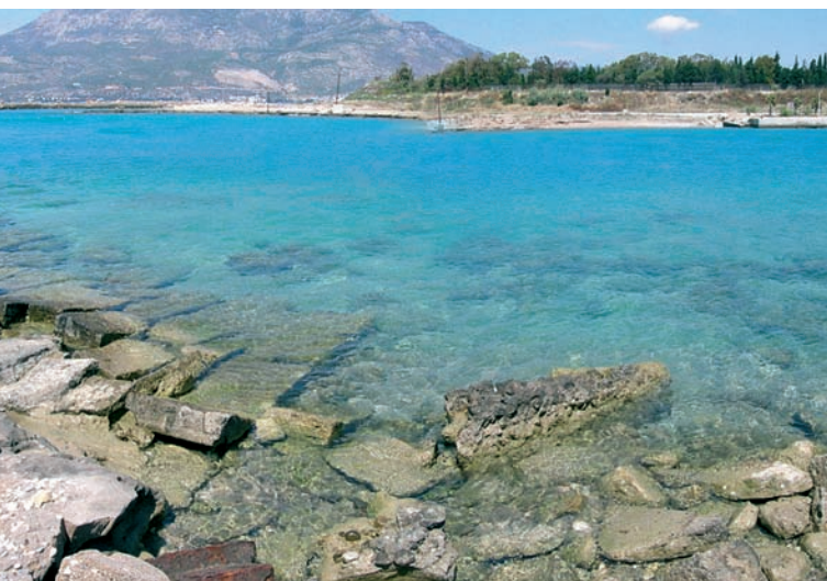
The extended platform which once constituted a part of the western terminus of the Diolkos today lies in ruins.