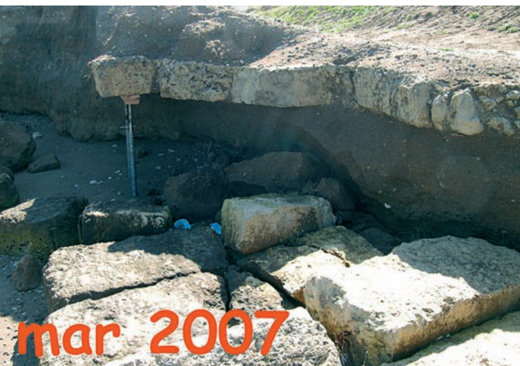
One of the two points supported at the beginning of March 2006 by the Direction for the Restoration of Ancient Monuments.