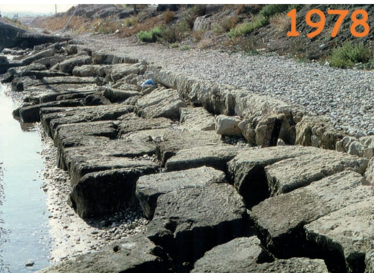
An image taken in 1978 by the German researcher Walter Werner shows already serious erosion.