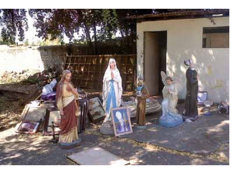
Villa Alegre, Region del Maule, La Merced Church