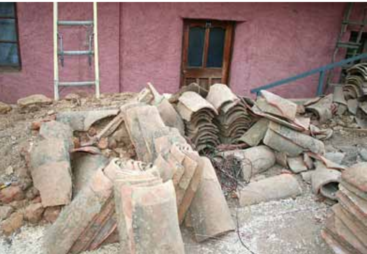
Vichuquen, Region del Maule