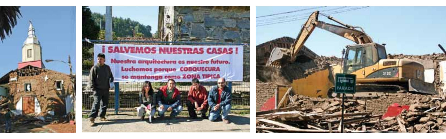
Coquecura, Region Biobio

Villa Allegre, Region del Maule, La Merced Church