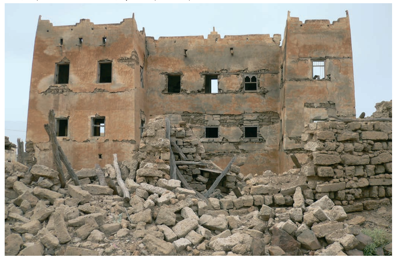
Mirbat, collapsed house of a rich merchant, Bayt al-Siduf