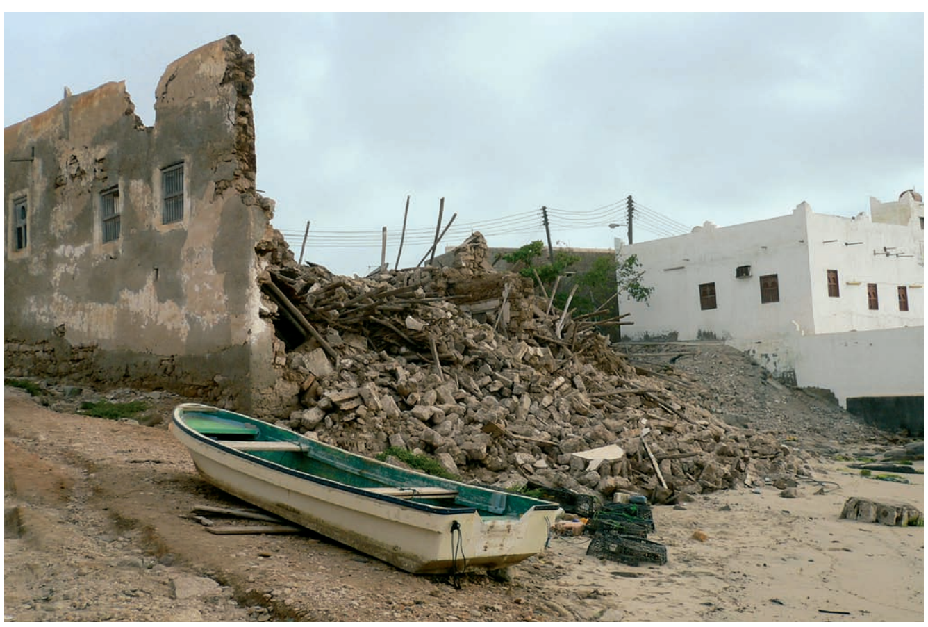
Mirbat, damage caused by a rain storm, 2007