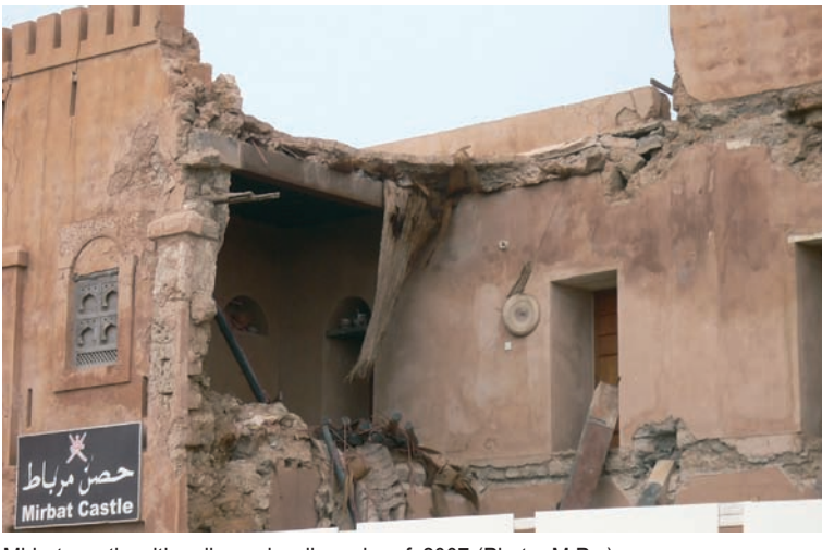
Mirbat, castle with collapsed walls and roof, 2007

Mirbat, like Taqah and Salalah, are witnesses to Oman's glorious past as a seafaring nation. Therefore, the old quarters of these cities should at least be documented and, if possible, be preserved for the coming generations.