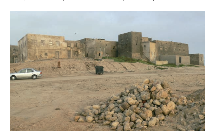
Mirbat, abandoned houses