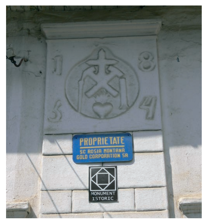
One house after the other is bought by the Roşia Montana Gold Corporation

As the natural and the cultural heritage of Roşia Montana constitute a common asset of the Romanian as well as European citizens, we consider that the responsibility for their care and preservation are subject to both Romanian and European authorities. This is